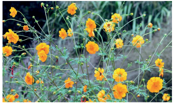
Sulfur cosmos, Cosmos sulphureus , add height and movement to the landscape.