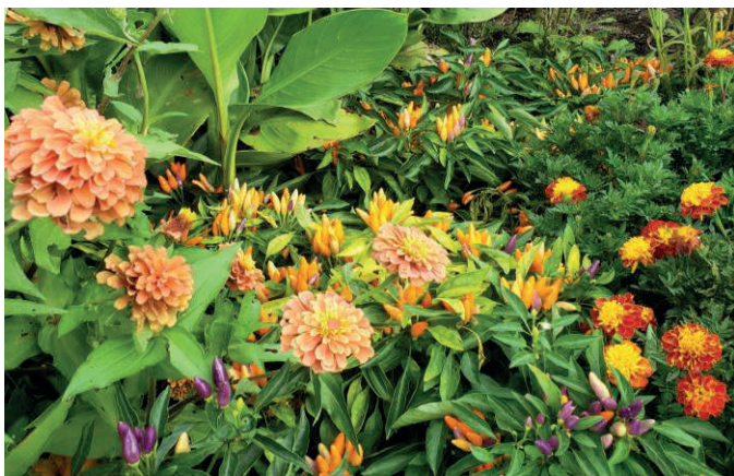
Mixed annual border at the UT Gardens, Jackson located at the West Tennessee AgResearch and Education Center.

Though seed starting can require attention to soil temperature, lighting, depth, scarification and stratification, don't be intimidated. This guide promotes those easier plants to grow from seed that will provide colorful and budget friendly additions to the Tennessee home garden.