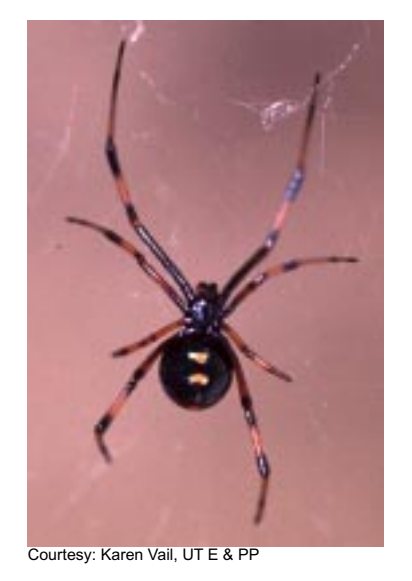
Figure 2. An immature female Latrodectus sp.