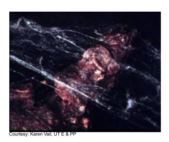
Figure 4. Webbing of a Lactrodectus sp.

The southern black widow prefers dark, sheltered areas. In nature, the females construct webs in hollow logs and under loose bark or stones, in small trees and under bushes. Humans have provided additional suitable habitat in the form of crawl spaces under houses; firewood piles; under boards and furniture; inside boxes; in seldom-worn shoes; and behind and under debris, drainage pipes, false ceiling areas, out-houses, sheds, barns, well houses and root cellars. Northern black widow females tend to make their webs in the branches of trees.