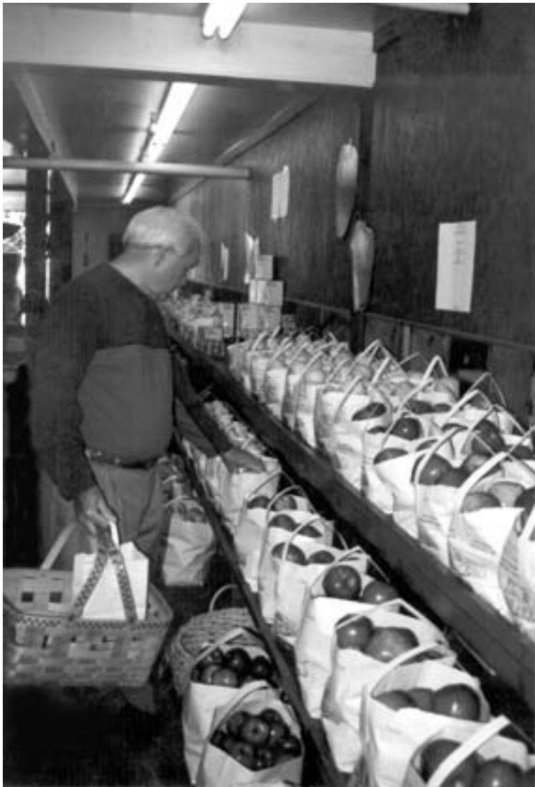
Retailers sell directly to the consumer.

native buyers and new sales locations and finalize orders with retail outlets. Most agent wholesalers represent specialized products and provide their service for a fee or commission.