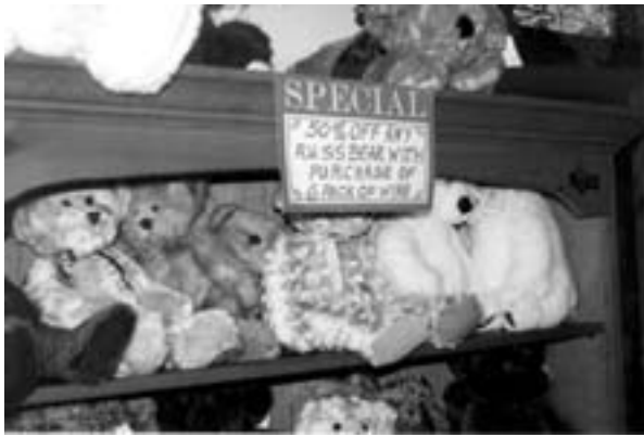
Offering a discount on multi-product purchases will increase gross sales.

The place section should describe how the product will get to consumers. This is normally where the planned marketing channels are described. The place component of the marketing plan should also include the distribution plans that will be used to deliver products. This section should also address issues related to the needed distribution services and resources.