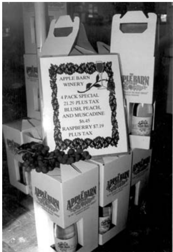
More sales per customer may result from multi-unit packages priced at a discount than sales from individually priced items.