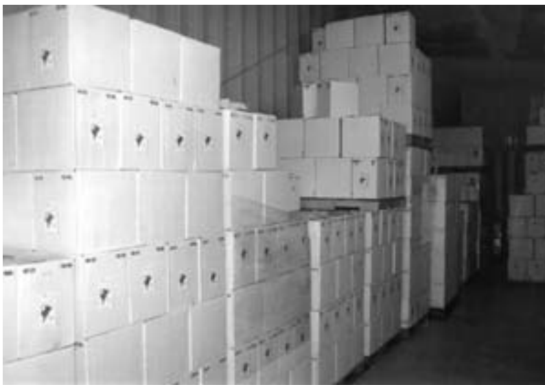
One of the main functions of a distributor is to warehouse products.

Another market channel used to sell value-added products is a distributor. The main function of a distributor is to warehouse, take orders, invoice and deliver products. Distributors are not normally responsible for selling products. A typical distributor is involved with various product lines and usually covers a multi-state region. Distributors are not necessarily interested in carrying new products if they do not have a good track record of proven sales. When approaching a distributor, it is helpful to have historical sales data for the product(s). Distributors charge for their services, and this charge can be a flat fee or a percentage of sales. Many large retail channels encourage their vendors to use distributors to reduce the problems of a relatively large number of delivery trucks and invoices.