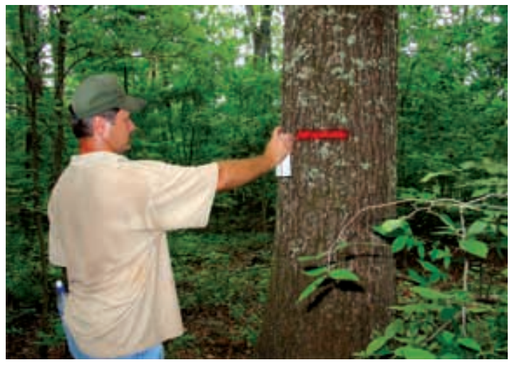
Select, mark, measure and appraise the timber to be harvested.

Included in this step is the measurement of wood volume to be harvested. Trees are typically sold using one of two units: board feet or weight. A board foot measures 144 cubic inches, equivalent to a board with dimensions 12" x 12" x 1". Weight is measured in tons. Foresters will tally trees by species, then sum the total estimated volume. An example of a timber summary is below: