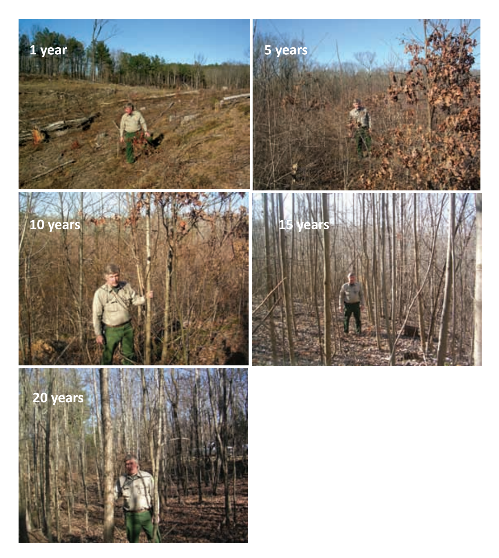
After a timber harvest, the forest will immediately respond with new growth. This sequence shows the development of a new forest at five different locations following timber harvesting: 1 year - 5 year - 10 years - 15 years and 20 years later (Location Chickasaw State Forest).