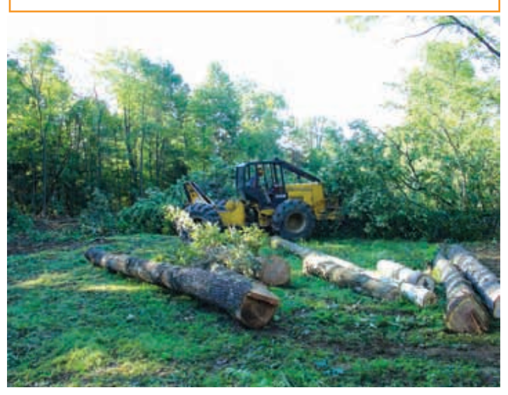
Monitor the logging.