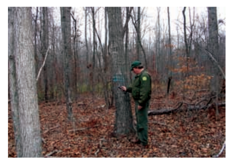
Confirm property boundaries.

http://extension.tennessee.edu/publications/ Documents/SP595.pdf