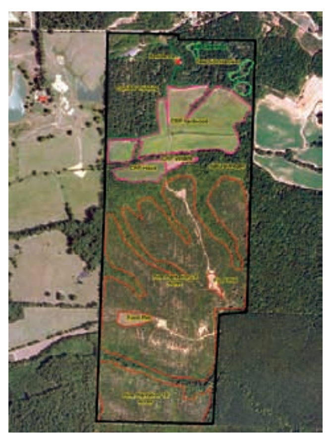
A plan will designate stand boundaries.

http://extension.tennessee.edu/publications/ Documents/PB1679.pdf