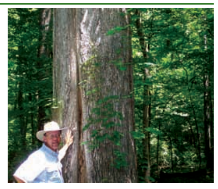
First, see a forester.

Before marketing timber, seek the expertise of a professional forester, and perhaps several. Professional foresters have a four-year B.S. degree in forestry and have dedicated their career to practicing sustainable woodland stewardship. Some can guide you through the entire timber marketing process; others offer limited services. They will have knowledge of how woodlands grow, timber value and market conditions, local loggers, wildlife and more. Three types of foresters are common: