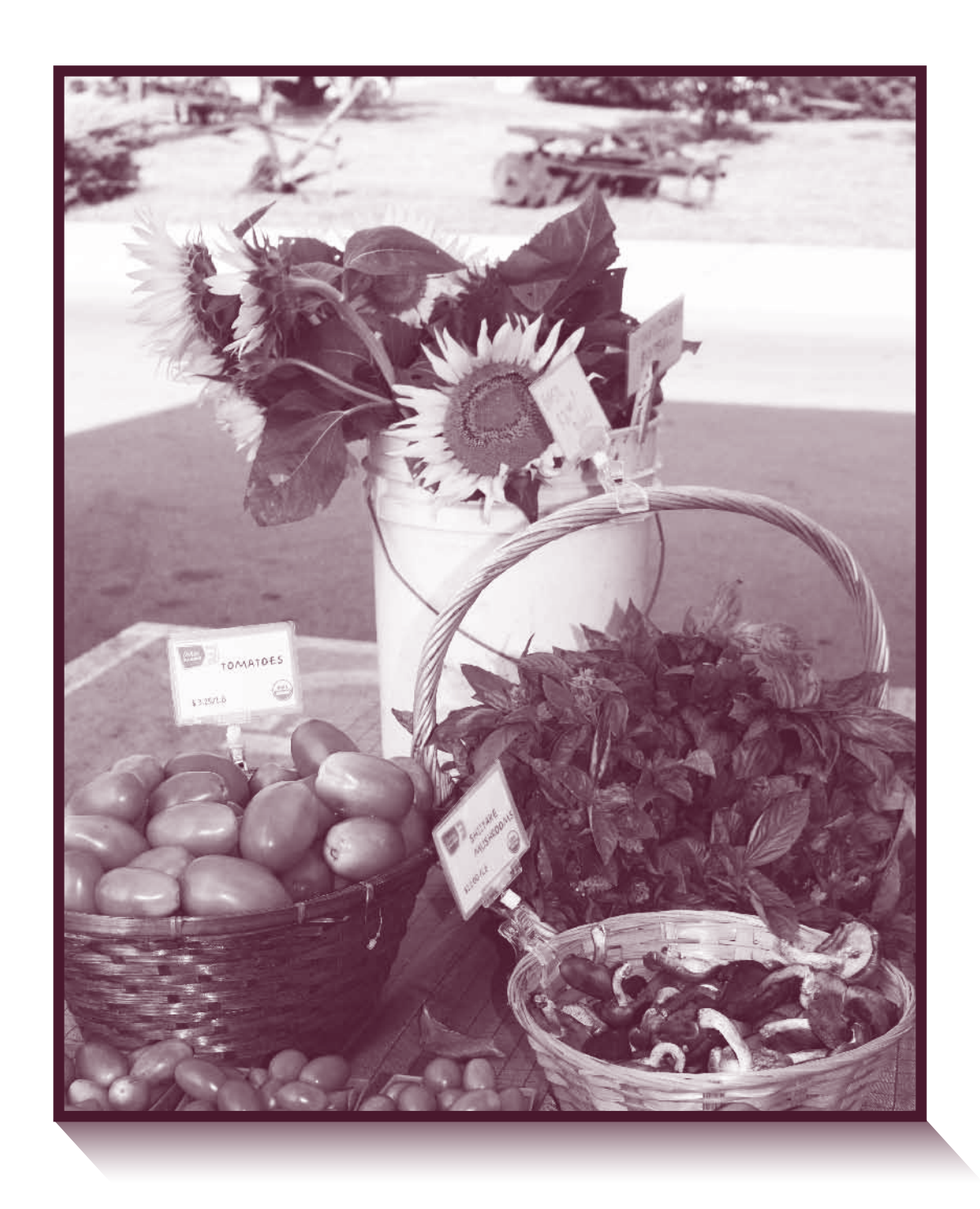
Find \ additional \ resources \ from \ the \ Center \ for \ Profitable \ Agriculture \ at \ http://cpa.utk.edu