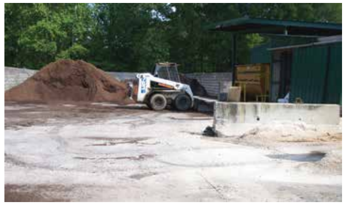
Figure 4. Good Example: Substrate is stored on a welldrained container pad with dedicated equipment to prevent contamination from soil.

Substrate should be stored on a concrete slab with adequate drainage (Figures 4 and 5).