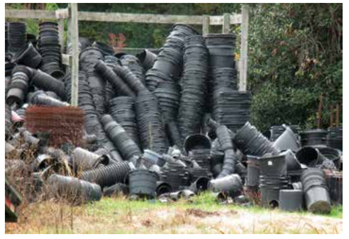
Figure 3. Bad Example: Containers are in contact with soil that may harbor root rot pathogens.

Substrate should be stored on a concrete slab with adequate drainage (Figures 4 and 5).