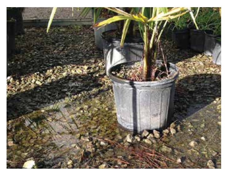
Figure 8. Bad Example: Over-irrigation and/or poorly draining container pads can lead to root rot and overall poor plant health.

Drain tiles may need to be installed to allow for adequate drainage of production fields. Knowing how to manage water and irrigating properly are important components of a systems-based pest management approach.