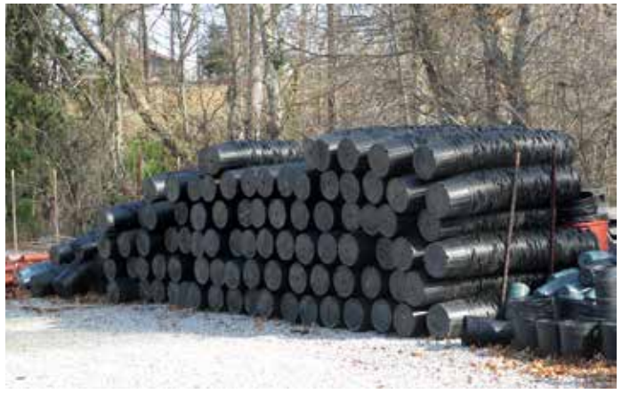
Figure 2. Good Example: Containers are stored on gravel, preventing contact with soil or puddled water.

Whether you are a container producer or grow plants in the field, following simple sanitation tips can help mitigate the spread of unwanted insects, mites, pathogens or weeds within your production areas. Container growers who reuse pots should follow proper sanitation and handling guidelines because it is the pot that should be recycled, not pests! Cover the ground with a layer of gravel to keep containers from coming in contact with soil or sitting in puddles, both of which can spread pathogens that cause root rot diseases (Figures 2 and 3).