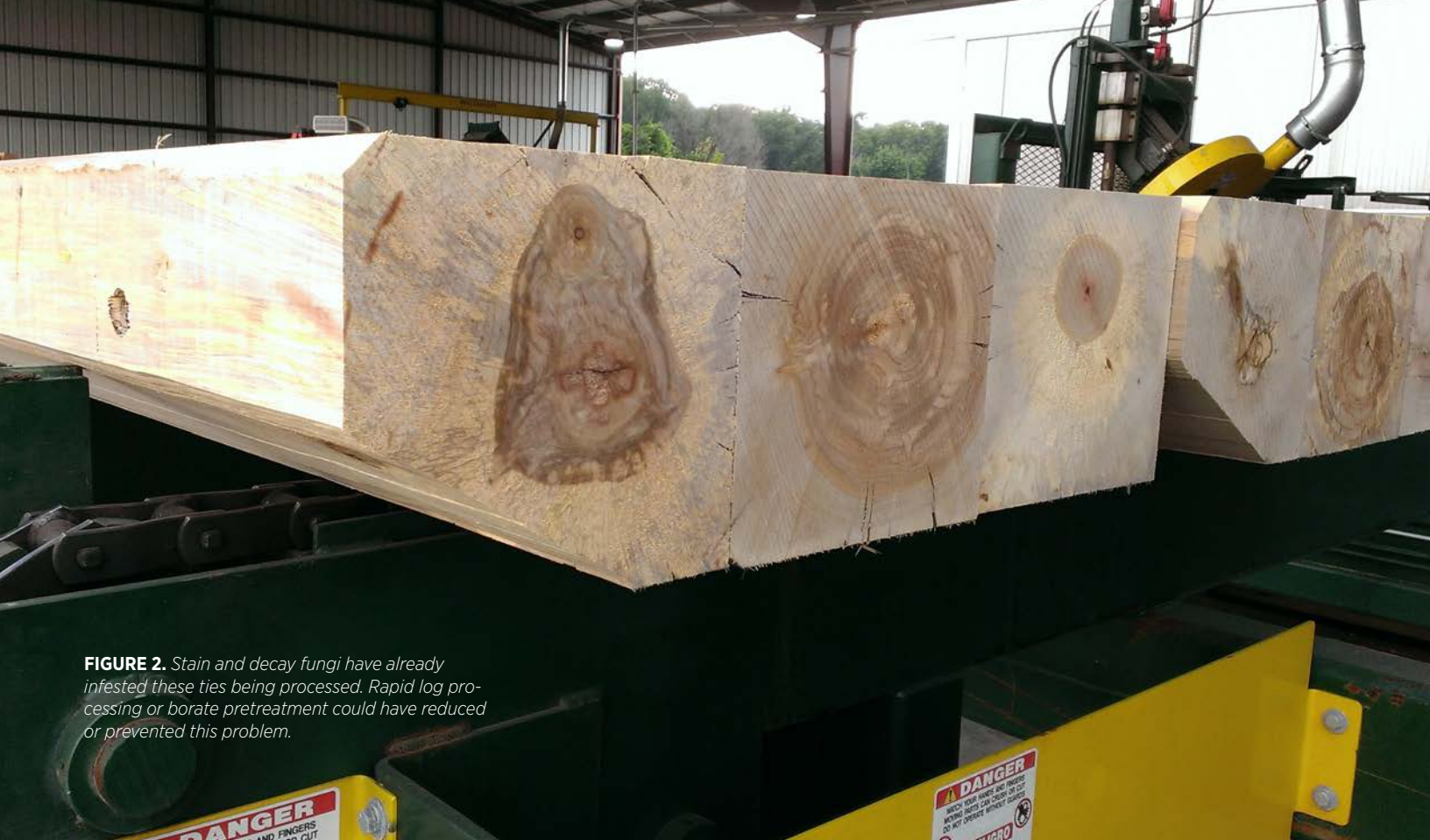
FIGURE 2. Stain and decay fungi have already infested these ties being processed. Rapid log processing or borate pretreatment could have reduced or prevented this problem.