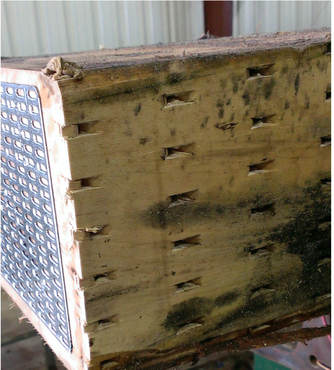
FIGURE 12. The incising of this tie will help penetration during pressure treatment. The end plate will reduce the severity of end splits.