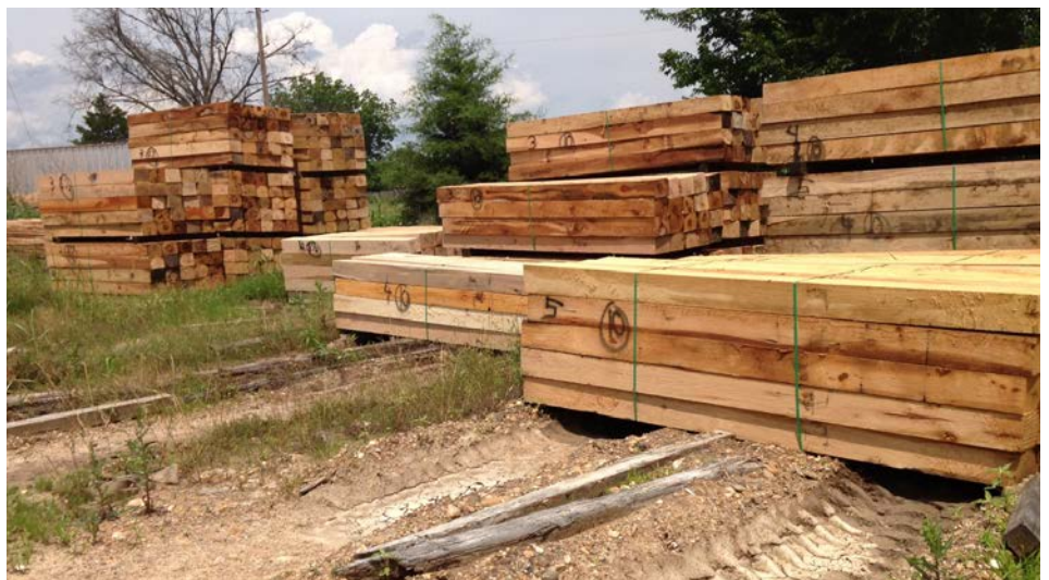
FIGURE 3. Dead stacking nonseasoned ties prevents drying and will quickly lead to decay and/or insect damage. Soil contact during storage or drying is also to be avoided.

Many insects and fungi exist that feed on, or nest within, freshly harvested logs or sawn material. Thus, green (nonseasoned), unprotected wood such as a freshly cut crosstie is a preferred material. Furthermore, these organisms