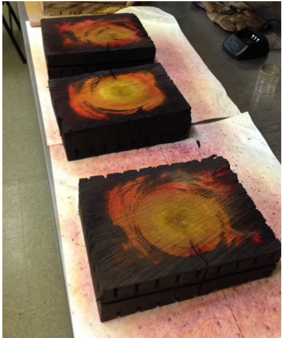
FIGURE 14. A dual-treated (two step) tie. The inner portion not penetrated by the creosote treatment is protected by the borate (curcumin sprayed to show boron as red).