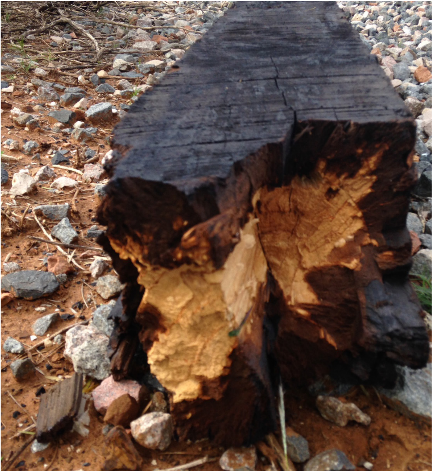
FIGURE 11. Stack burn ruined this tie before it was treated. The blunt (“brash”) break of the wood in this tie is typical of the effects of fungal decay. Decay also increases permeability. The creosote treatment here shows excellent penetration. Unfortunately, the creosote preservative was applied after the damage was already done.