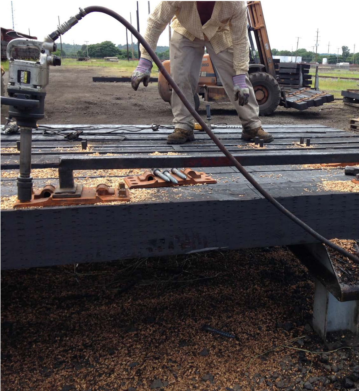
FIGURE 10. Drilling holes in a treated tie can expose untreated wood. Whenever possible, holes, daps, etc., should be cut before pressure treatment. If drilling or fabricating must be done after treatment, preservative must be applied locally at that time. Such “field” treatments are required under AWPA Standard M4, and copper naphthenate at 2 percent Cu is standardized for ground contact applications.