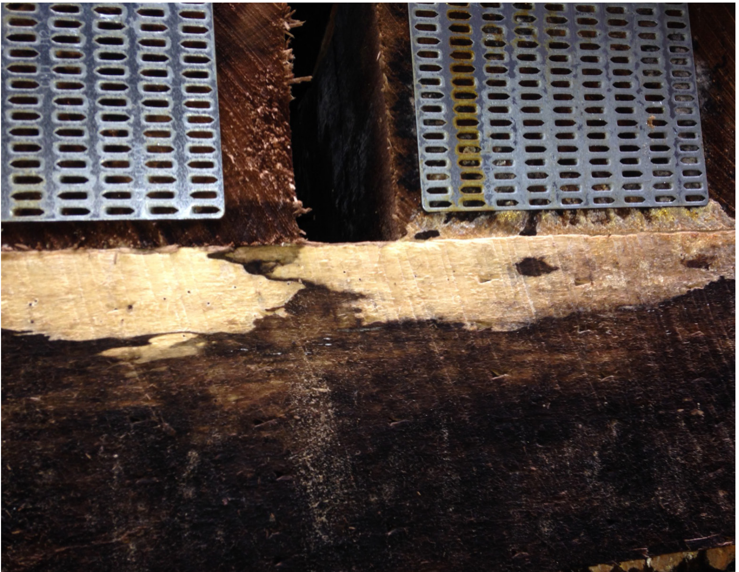
FIGURE 7. The white areas are rotten. This “stack burn” is occurring at the touch points between ties, where drying is retarded.

the wood. Such rot greatly weakens the wood locally, even when only a small percentage of the wood’s mass in that region has been consumed by the fungi. Even with rapid processing from sawing to treatment, some stack burn will occur, but research suggests that if everything is done correctly, the strength of the tie as a whole is robust. However, the longer the time between sawing and preservative treatment, the greater the risk for stack burn that eventually will ruin the tie.