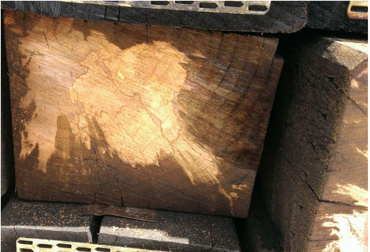
FIGURE 9. Stack burn weakens wood and can also interfere with treatment. Fungal activity can increase moisture content locally. Creosote failed to penetrate the areas where the fungus was established in this tie. The untreated areas are prone to decay in service.

1 Gauge retention estimates the average amount of preservative in each tie by measuring the amount of preservative taken up by the whole load of ties. Treating “to refusal” means applying the pressure cycle for long enough that the ties will not accept any more preservative.