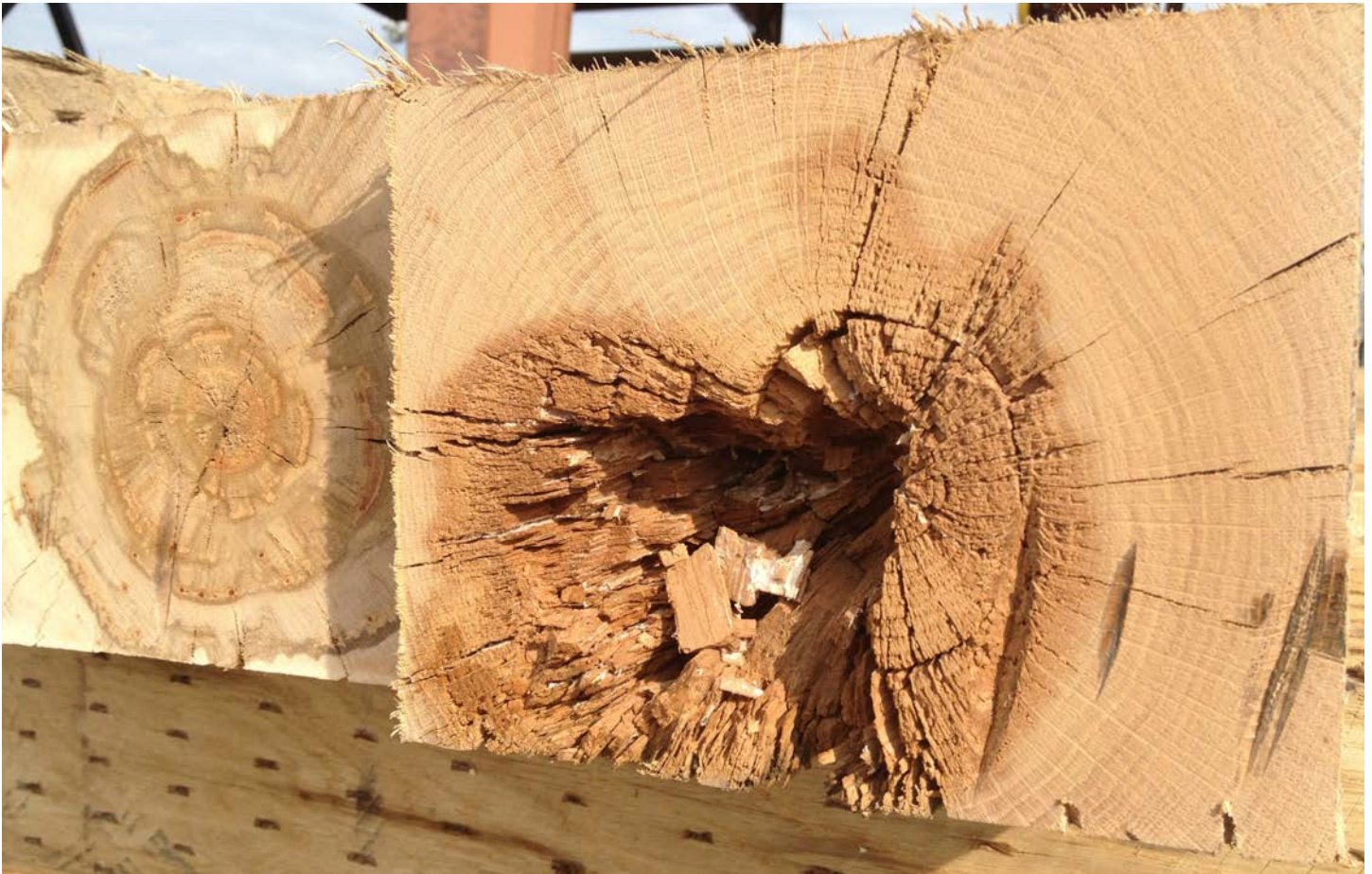
FIGURE 1. The rot in this freshly cut tie occurred in the living tree. It should be culled.

This guide explains the causes of tie degradation during manufacture and presents options that will reduce these risks. Some of the suggestions given here may already be standard practice in some organizations. Others may appear to be unnecessary or impractical. However, an installed railway tie represents a significant monetary investment. We suggest that proper handling procedures will ensure that the ties perform to their best potential, resulting in very significant long-term savings.