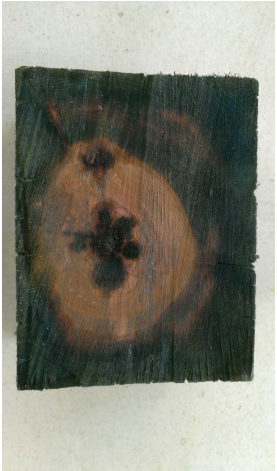
FIGURE 13. The heartwood of this tie was not penetrated by the copper naphthenate pressure treatment. Unless a diffusible preservative (e.g., borate) is used, the heartwood will not be fully protected in service.

Tests of dual treatment ties (using a two-step process) have demonstrated greatly extended service life. Because borate is inexpensive and has other benefits, dual treatments have become popular. The application of borate to the nonseasoned ties can help prevent stack burn and insect infestation during the drying process. If the ties are not chemically protected during drying, ensuring rapid drying and avoiding close stacking at sawmills or in gondolas for extended periods is even more important.