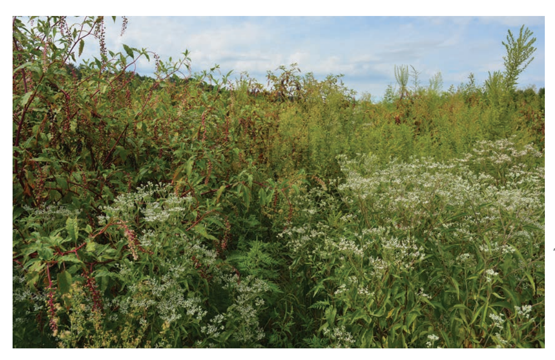
If you think this looks "weedy" or "snakey," then you might need to check your perspective. This field is providing excellent cover for northern bobwhite, wild turkey, eastern cottontail, and white-tailed deer fawns.

The following set of photos shows examples of old-fields and how they may be managed for wildlife species. Compare your field(s) with these photos to give you an idea of how your fields might look when managed for various wildlife species.