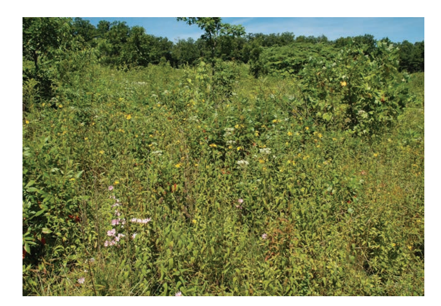
This field was created by clearing a section of woods. It is maintained by burning every 3–4 years and by spot-spraying undesirable plants. By extending the disking or fire-return interval, more perennial herbaceous and woody plants establish. This structure provides more bedding cover for white-tailed deer; more escape cover for eastern cottontail or northern bobwhite; and nesting cover for wild turkey, northern bobwhite, blue grosbeak, indigo bunting, and yellow-breasted chat.

This field is dominated by naturally occurring native grasses, forbs, and brambles, specifically little bluestem, beaked panicum, purpletop, goldenrod, slender lespedeza, rabbittobacco, hyssopleaf thoroughwort, blazingstar, and blackberry. It is burned every 1-2 years. The structure of the field is near perfect for grassland birds, such as grasshopper sparrow and eastern meadowlark, but the landscape is predominately forested and does not support grassland birds. Northern bobwhite would nest in the field, but shrub cover is lacking and the landscape does not support bobwhite. The structure is relatively poor for white-tailed deer fawns, eastern cottontail, or nesting wild turkey. There is some forage for white-tailed deer, but it is not great. More forbs and woody structure are needed for most species. Light disking following prescribed fire in late summer/early fall would encourage more forb cover, and extending the fire-return interval to 3–5 years would encourage more woody cover.