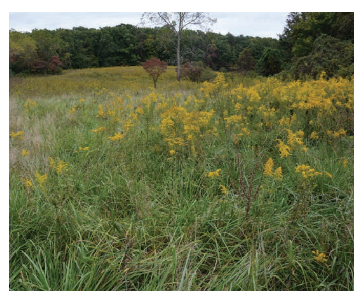
Old pastures and hayfields often contain a mixture of plant species, but still have a "carpet" of undesirable grass growing underneath, such this tall fescue. Preparing the site prior to spraying by repeated mowing, haying, or burning clears debris that would block the herbicide from contacting the grass.