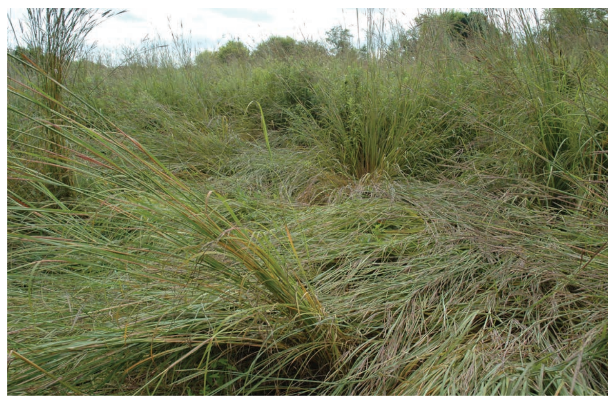
Planted native grasses often are either planted too dense or they become too dense over time to provide suitable structure for most wildlife species.

native grasses can be reduced with a broadcast application of imazapyr (such as 24 ounces of Arsenal AC per acre) or glyphosate (2 quarts per acre of a glyphosate herbicide that contains at least 41 percent glyphosate) in late May or early June when the grasses are about 18–24 inches tall. By late July, the grasses will be browned out and the area can be burned when conditions permit. Burning at this time will reduce accumulated dead fuel, improve conditions at ground level, and increase plant diversity, especially by increasing the forb component. These applications should reduce native grass density to approximately 10–30 percent coverage. Grass density should be no more than 30–50 percent when managing old-fields for most wildlife species; the exception being grassland songbirds, which select fields with more than 50 percent grass coverage.