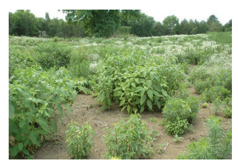
This field was a pasture of tall fescue and other grasses the year before the photo was taken. The pasture was sprayed in the fall with a glyphosate herbicide. Now, the following June, common ragweed, daisy fleabane, horseweed, pokeweed, late flowering thoroughwort, and 3-seeded mercury provide outstanding brooding cover. Nothing was planted.