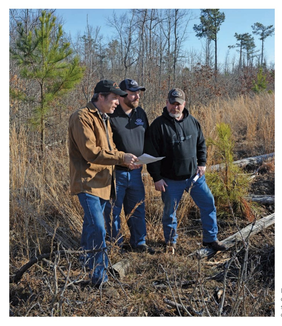
Evaluating the site and discussing your objectives with a wildlife biologist can save you time and money and help you determine your best course of action.

wildlife species, and help you with a management plan that also will consider property composition. That is, how are fields and other open areas located across your property, and how does that arrangement fit the needs of the wildlife species you are managing? Do not overlook creating additional fields where woods may be now, and some existing fields may suit your objectives better if they were planted in trees or allowed to "grow up." For example, trying to maintain fields can be difficult in low-lying bottomlands that are more ecologically suited for bottomland forest. Or, maintaining an open field for deer adjacent to a road could encourage poaching. Allowing that field to fill in with shrubs and trees might be a better strategy.