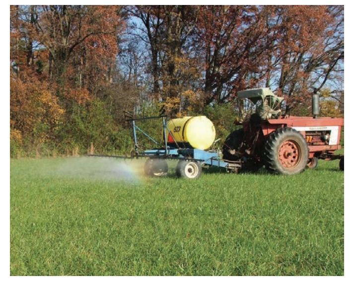
Perennial cool-season grasses should be sprayed in the fall for best control.

Preparing the field for spraying is an important consideration, especially if the field has not been hayed or grazed in a few years and has a mixture of forbs, grasses, brambles, and shrubs scattered across the field. Optimally, you want to spray green, growing grass, not dead stems and thatch from previous years. Haying, repeated mowing, or burning in late summer prior to spraying in late fall (or preparation in late winter prior to spraying in spring) will "clean" the field and stimulate fresh growing grass. If the field is not prepared, and dead stems and thatch are mixed with the grass you intend to spray, you can increase the volume of total spray solution from 15 to 25 gallons per acre to apply a larger volume and droplet size and help ensure the herbicide gets to the growing grass underneath the dead stems. The rate of herbicide per acre should remain the same.