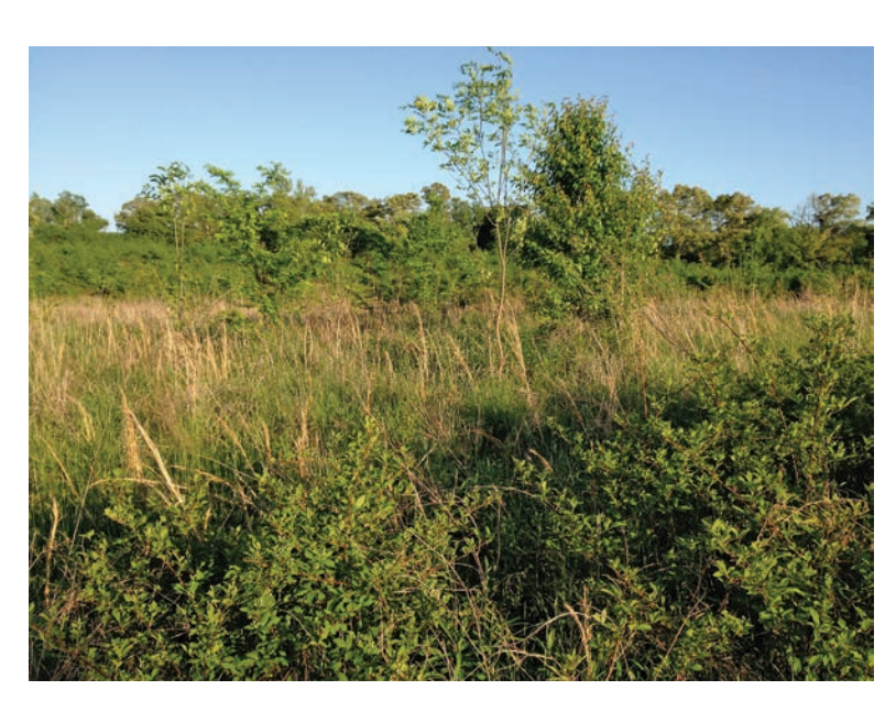
Open areas with forbs, some grass, and scattered shrubs provide excellent nesting, brooding, and escape cover for bobwhite. Shrub cover is requisite and limiting on many properties.

Wild turkeys use old-fields dominated by forbs for brooding and foraging and areas with shrub cover for nesting, but shrub cover is not required for nesting. A fire-return interval of 3–5 years will maintain an old-field attractive for wild turkeys on most sites, but burning more frequently will be necessary on some sites. Relatively small fields (less than 5 acres) may be managed by burning or disking annually or every two years to maintain desirable forb cover for broods. Spot-spraying can be used to reduce coverage of undesirable plants and encourage more desirable plants. Mowing should not be used to maintain early successional stages for wild turkeys because mowing creates a deep thatch layer that limits mobility of wild turkey poults and limits the seedbank from germinating.