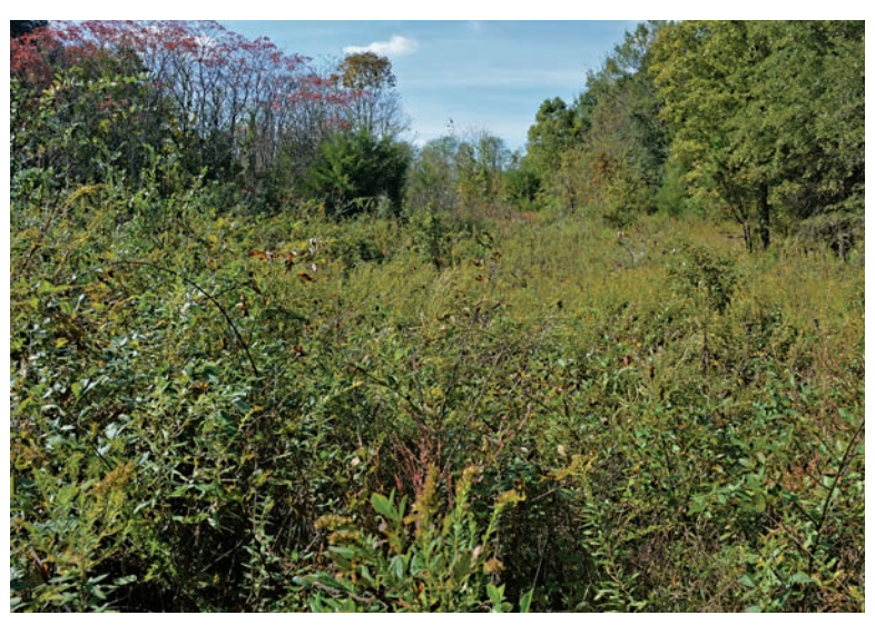
Eastern cottontails require thick, shrubby cover that is well intermixed with forbs and grasses.

Management for eastern cottontail is similar to northern bobwhite with the exception that the management unit size may be smaller because rabbits have a smaller average home range (25 acres) than bobwhite (90 acres), and the firereturn interval should be a little longer because rabbits require more dense shrubby cover (thickets) than bobwhite. Blocks of cover up to 5 acres will allow management of <sup>1</sup>/<sub>5</sub> the average size of a rabbit's home range each year with a 5-year fire-return interval, maintaining fresh growth for forage as well as protective cover. Alternatively, some areas may be burned every 1–3 years as foraging areas, whereas thick escape cover may be burned every 5–7 years to maintain brushy cover and prevent young trees from shading out desirable groundcover.