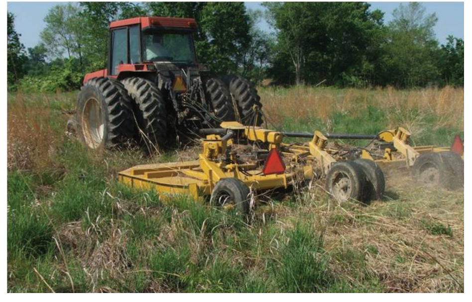
Mowing is the least desirable method to maintain an early successional community. Mowing builds up thatch, which inhibits the seedbank from germinating and limits mobility of small wildlife at the ground level.