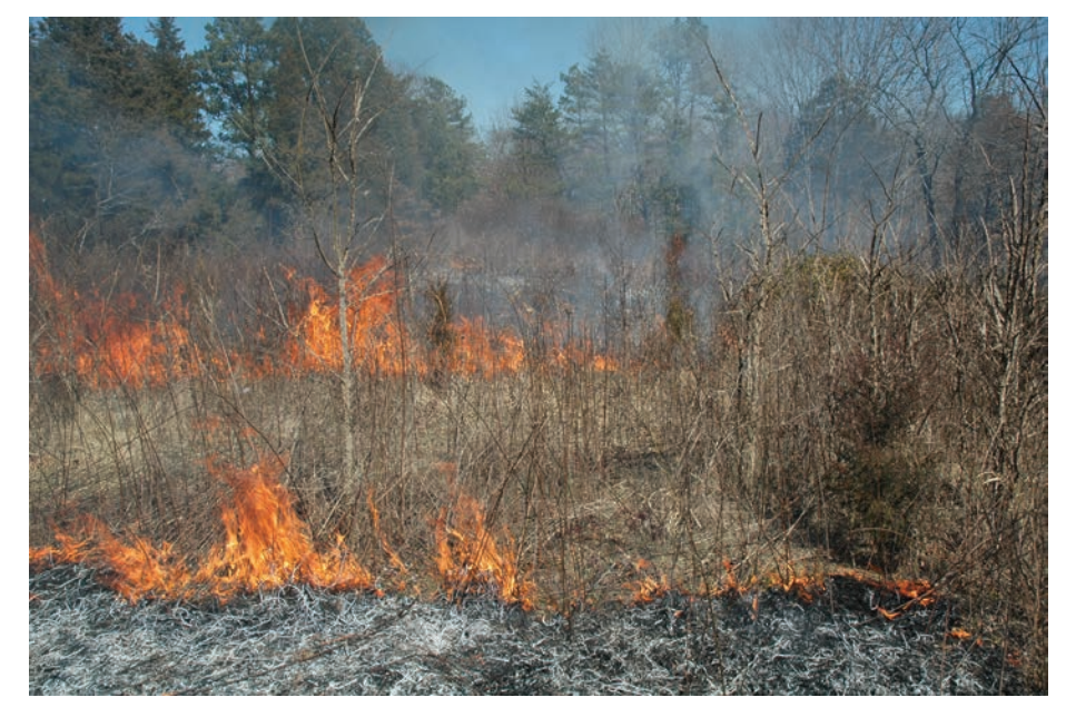
Prescribed fire sets back succession and stimulates the seedbank to germinate.

species. Of course, this average range of frequency can vary by site, and you should never plan to burn on an exact frequency, but rather let the plant response in the field be your guide. Season of burning can influence plant composition. In general, burning during winter or early spring encourages more grass growth and only top-kills small trees. Burning later in summer and early fall generally encourages more forb response and fewer trees tend to resprout, but response varies by tree species.