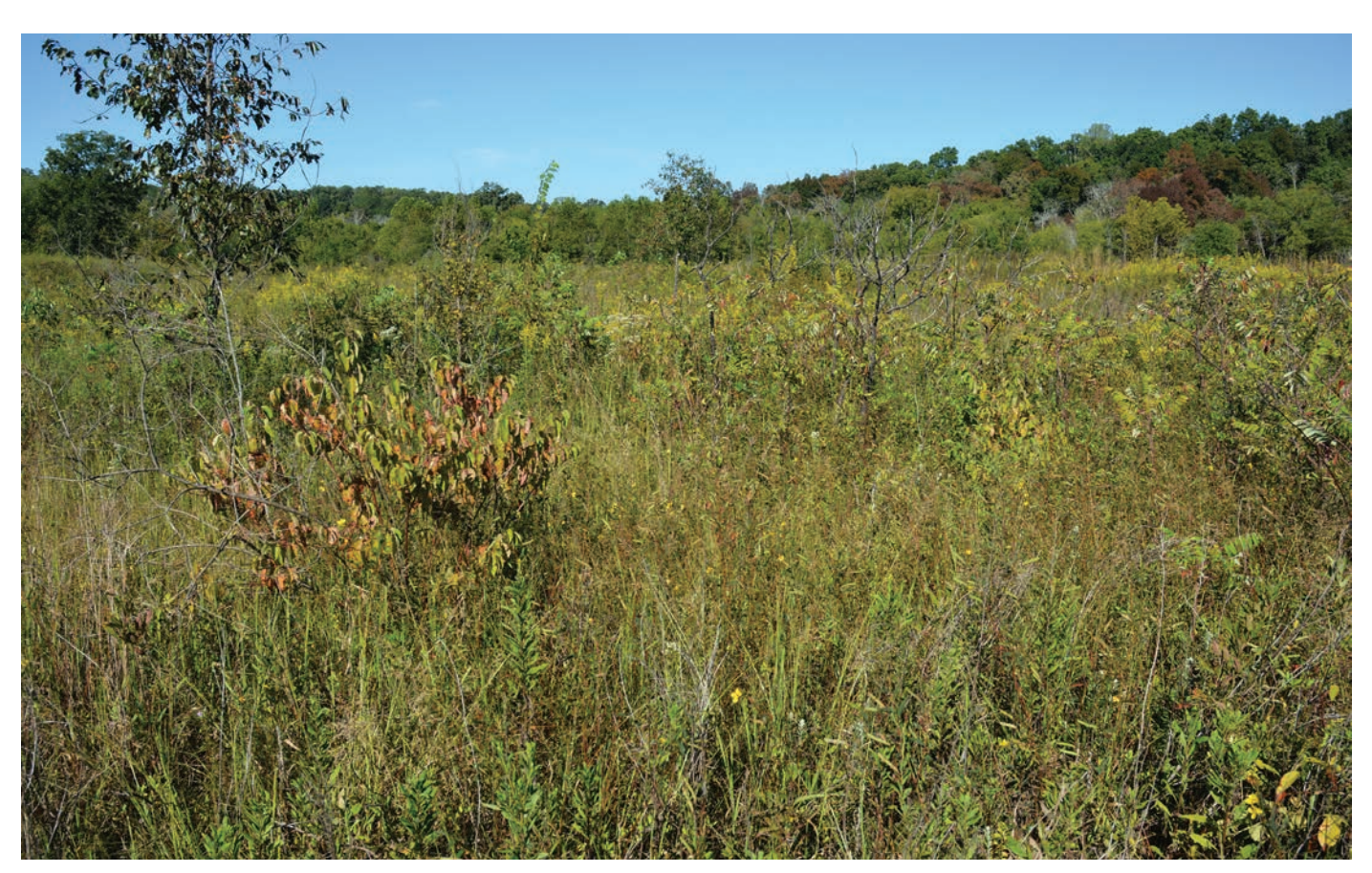
Old-fields can be managed to provide outstanding food and cover for wildlife. However, you have to know what various wildlife species require, you must realize the benefits of various plants over others, and you must understand the benefits of certain management techniques over others.

Not all wildlife have such specific requirements. Relatively small fields can be managed for white-tailed deer, wild turkey, eastern cottontail, and shrubland songbirds. This publication will describe how to manipulate vegetation composition and structure, and how to manage fields and other open areas properly for various wildlife species.