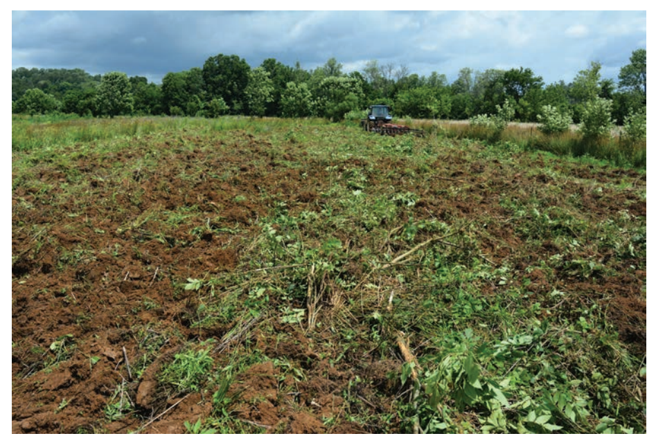
A heavy offset disk can set back succession even where small trees have colonized.

Prescribed fire is the most effective and efficient method to manage old-fields and other early successional plant communities. Fire sets back succession by controlling woody species and stimulates the seedbank. Fire influences vegetation structure by consuming leaf litter and other debris, which increases visibility and provides more open structure at ground level. Burning every 1–2 years will maintain a field of grasses and forbs. Burning every 3-4 years will allow scattered shrubs and trees to persist in the field, which is good for many wildlife species. Burning every 5-6 years will allow considerable woody encroachment on most sites, which is good for various wildlife