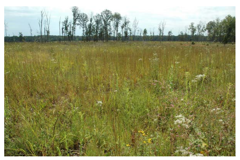
Large fields dominated by medium-height grasses, such as broomsedge bluestem, and little bluestem, in open landscapes provide habitat for grassland birds.

Prescribed fire and mowing every 1-2 years can maintain habitat for grassland birds, including eastern meadowlark, grasshopper sparrow, Henslow's sparrow, LeConte's sparrow, and dickcissel. Disturbance during the nesting season (late April to mid-August) should be avoided. If woody encroachment is problematic, burn during the late growing season (late August through October) or spot-spray with a selective herbicide, such as triclopyr. Light disking may be completed after burning to stimulate additional forb cover (20-30 percent) if lacking. Grazing also can be used, but grazing intensity must be moderated to provide sufficient structure for nesting (maintain vegetation height at least 15 inches). An exception is patch-burn grazing, which promotes burning approximately \frac{1}{4} to \frac{1}{3} of the pasture each year. Cattle intensively graze the recently burned portion of the pasture while birds concentrate nesting in the unburned portions.