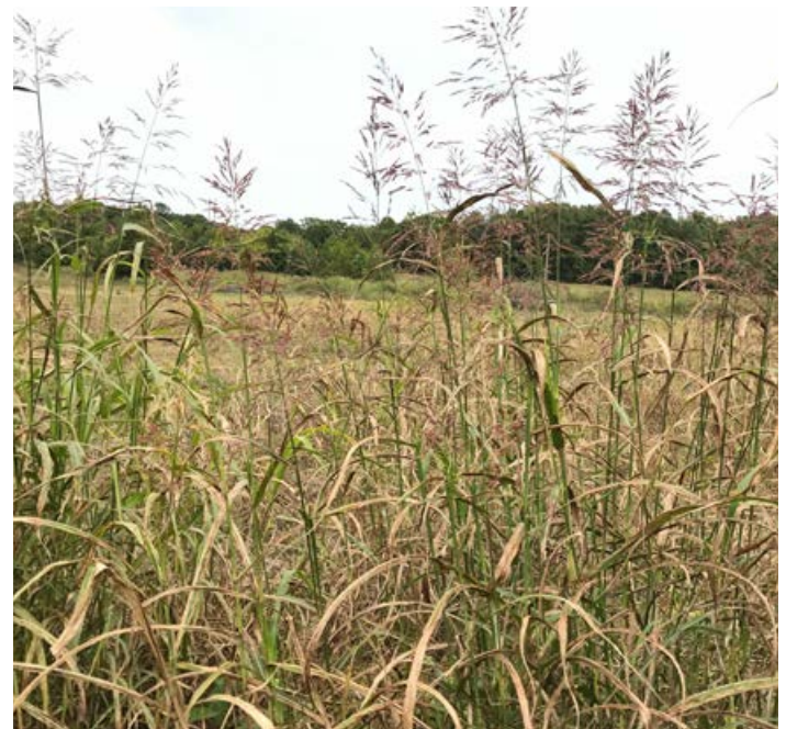
Johnsongrass can be problematic in NWSG stands and may be considered noxious in your state. Herbicide applications are the best option for controlling johnsongrass.

Johnsongrass is a nonnative perennial warm-season grass common in the southern United States. Johnsongrass is present at the time of NWSG establishment in many fields. Excessive johnsongrass can outcompete NWSG seedlings and reduce establishment success, which may lead to a failed planting. Johnsongrass will persist in established stands if left unmanaged, which can lead to a monoculture of johnsongrass that is dense, provides poor structure for some wildlife species, and offers little or no food if forbs are outcompeted. Seedling johnsongrass can be controlled preemergence with an application of imazapic (8 oz/acre). However, johnsongrass arising from rhizomes is not controlled with a preemergence application. Johnsongrass can be controlled postemergence in established NWSG stands with an application of imazapic (12 oz/ac) or sulfosulfuron (2 oz/ac) without harming many NWSG and desirable forbs. Many grasses planted in NWSG stands are tolerant of sulfosulfuron, whereas many grasses and forbs planted in NWSG stands are tolerant of imazapic (refer to herbicide label for specific species). Of course, spot-spraying johnsongrass with glyphosate (2% solution) is an option, if coverage of johnsongrass is not extensive.