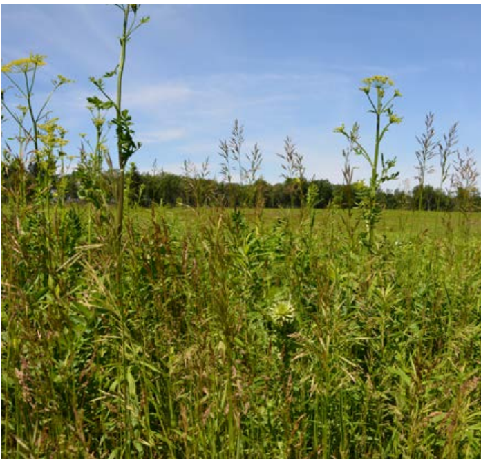
Numerous undesirable plants are outcompeting desirable plants in this field. Cool-season perennial grasses, such as smooth brome, tall fescue, and Kentucky bluegrass as well as problematic forbs such as wild parsnip and musk thistle have invaded this field.

Herbicide application typically is the most efficient way to treat undesirable plants in NWSG stands, because you often can selectively treat those plants without killing desirable plants across the whole field. Various nonnative and invasive species respond differently to disking and prescribed fire. However, disking and fire can be used when appropriate for various species. There are many more problematic nonnative plants than the ones discussed below, but these include some of the most common problem plants in NWSG stands.