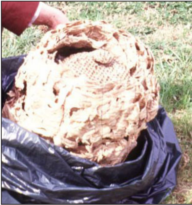
Figure 2. European hornet nest from unprotected site

in the spring, performing all the chores themselves including collecting material for nest construction, laying a small number of eggs, foraging and feeding the developing larvae. Once the first brood emerges, the queen's duties are confined to egg-laying, and the workers assume her other roles. Workers are infertile individuals that gather food and nest materials, expand the nest, feed the immatures, and defend and maintain the nest. Late in the season, 3,000 cells may be found in the 6 – 9 combs of the nest. On average, nests will contain 200 to 400 workers but may contain up