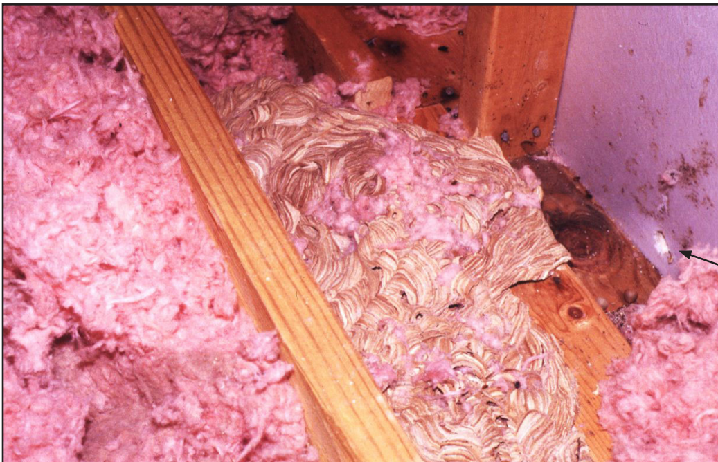
Figure 3. European hornet nest (18-inch diameter) removed from under attic insulation. Hornets entered the house through a knot that had fallen out of the cedar siding.

Locate the nest. Nests should be located and treated to provide long-term control. If the nest is not easily located, a ripe apple can be used as an attractant. After the hornets feed on the apple, follow them back to the nest or at least determine the direction of their flight. Move the apple