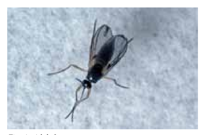
Fig. A: Adult fungus gnat

Damage is caused when the larvae, which feed in highly organic soils, infest the roots of African violets, poinsettias, carnations, Easter lilies, geraniums, cyclamens, bedding plants and foliage plants. Symptoms first appear as a loss in plant vigor. As the damage progresses, the plants may fade, begin to wilt suddenly and finally lose foliage.