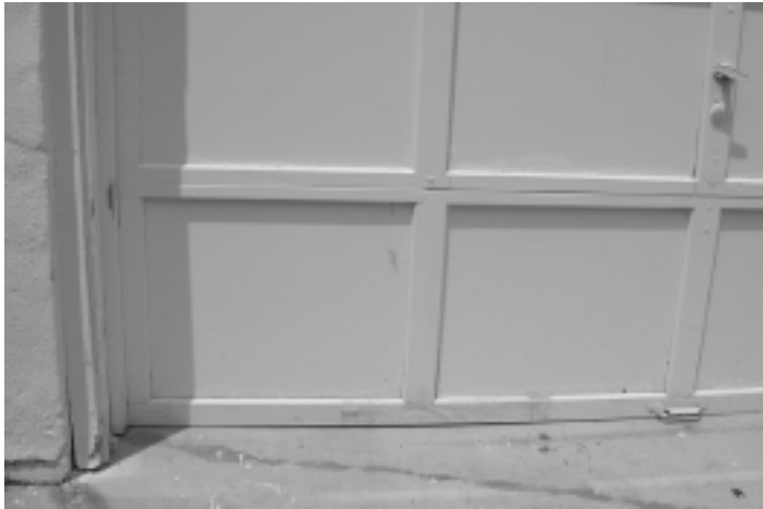
Figure 2. Gaps around edges of doors may be sealed with weatherstripping to exclude lady beetles.

other areas. Damaged window screens should be repaired. Insect screening may need to be installed behind attic and crawl space vents. See Extension PB1303, Managing Pests Around the Home , for additional information on excluding pests. Areas where the beetles have been seen congregating on the outside of homes should be cleaned with a mild detergent to remove any material which may attract other beetles to the site. If beetles still find a way into the home, place glue boards or pieces of double-sided, sticky tape near suspected beetle entry points. Once the entry point is located, it can be sealed. The beetles can be removed from the interior of the building using a vacuum and placed outdoors in a protected site.