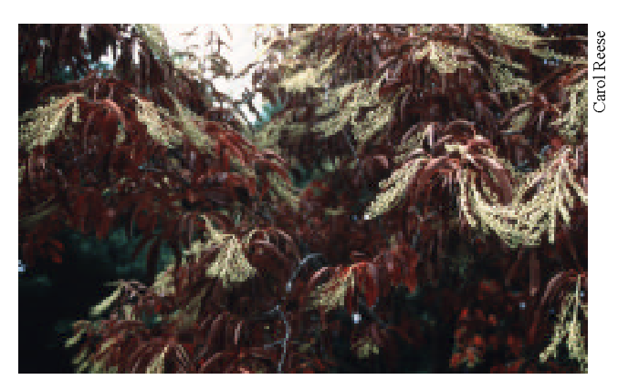
Sourwood is one of the earliest native trees to develop fall leaf

Fall color development depends on a number of factors, such as temperature, sunlight, rainfall and plant variety selection. Some plants develop good fall color every year, while other trees have the potential but do not develop color consistently. Late summer days that are warm and clear with cooler night-time temperatures are ideal conditions for fall color development. Trees that develop yellow fall color contain yellow pigments in the leaves. In summer, chlorophyll, the green color manufactured by plants when exposed to sunlight, masks the yellow color. In late summer or early fall, chlorophyll production ceases and existing chlorophyll is destroyed. The yellow-to-orange carotenoid pigments in the chloroplasts are unmasked and yellow fall color is present. In some years, the yellow is quite brilliant with some tree species, while in other years the leaves turn directly from green to brown.