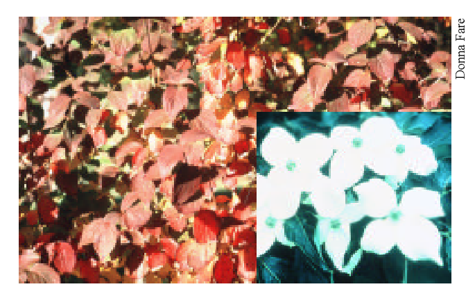
Kousa dogwood, Cornus kousa , flowers after the foliage has unfurled in the spring. Fall leaf color is mostly red.

and cool nights traps the sugars and other materials in the leaves rather than translocating them to other parts of the plant. This accumulation results in anthocyanin manufacture, which is revealed as red fall leaf color. Some plants are very sensitive to this process. This results in one side of the plant that is exposed to strong light developing red leaf color, while the opposite side is still yellow or green.