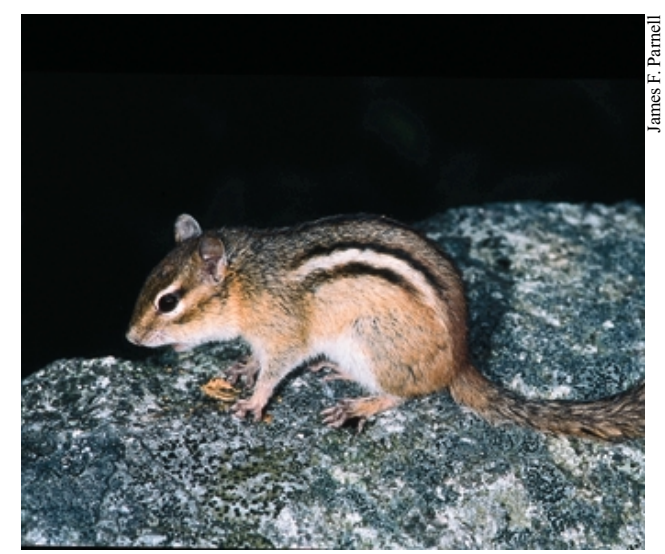
Chipmunks are a favorite animal of many backyard wildlife enthusiasts.