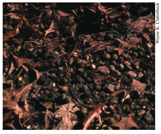
Oak (Quercus spp.) acorns are a source of hard mast for wildlife.