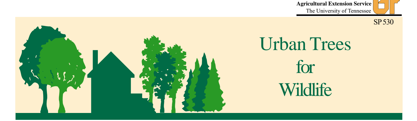
Wayne K. Clatterbuck, Assistant Professor Craig Harper, Assistant Professor Forestry, Wildlife & Fisheries

Viewing wildlife on your property is educational and fun. The kinds and numbers of wildlife that visit your backyard regularly depends on your location, size of area, variety of vegetation and amount of habitat development. Ideally, the habitat surrounding your home should be diverse with several species of trees, shrubs and flowering plants providing food and cover for wildlife throughout the year. The more diverse the vegetation, the greater variety of wildlife that can be attracted to the area.