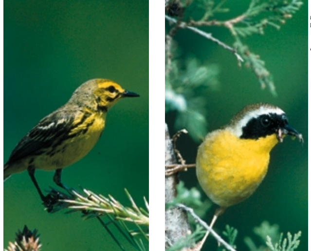
Praire warbler and common yellowthroat are summer residents of Tennessee.

• Plan both the horizontal and vertical structure of your trees and other vegetation to maximize wildlife habitat benefit.