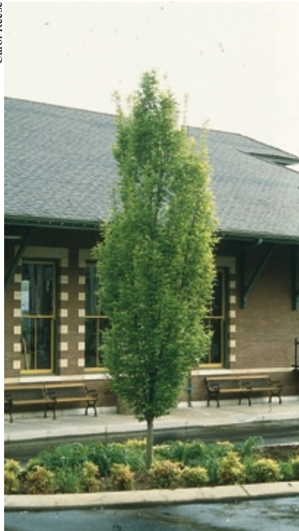
Columnar crown form of fastigiated European hornbeam ( Carpinus betula 'Fastigiata').

ner. Trees that mature greater than 70 feet in height need at least 15-20 feet of space from a building. If trees are to be planted in a mass or grouping, space trees at least one-half of their expected canopy spread.