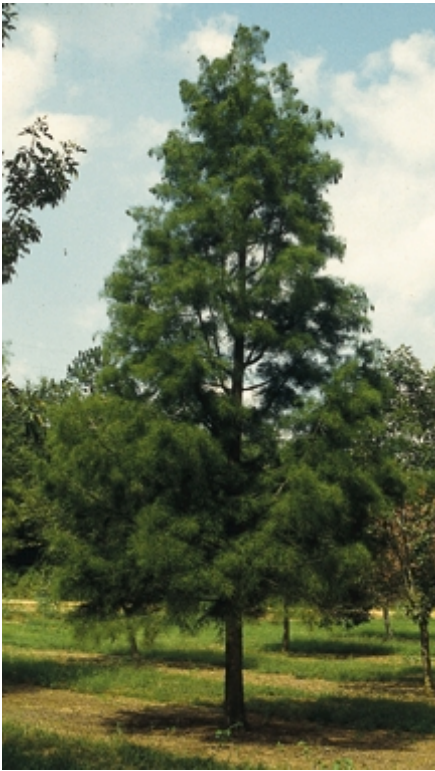
Pyramidal canopy form of pond cypress ( Taxodium distichum ).

A red maple, Acer rubrum , with a mature oval canopy can provide a d e q u a t e shade; but, 'Armstrong', a cultivar of red maple, is very columnar in form, thus providing little shade. The density of the branches and foliage determines the amount of shading. Sugar maples can produce a very dense shade that inhibits the growth of other plants. The Chinese pistache tree