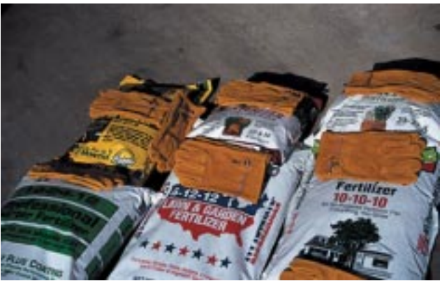
Many formulations of fertilizer are available commercially.