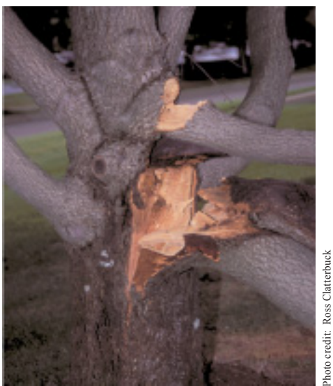
Weak branch junctions with the trunk of a Bradford pear tree.