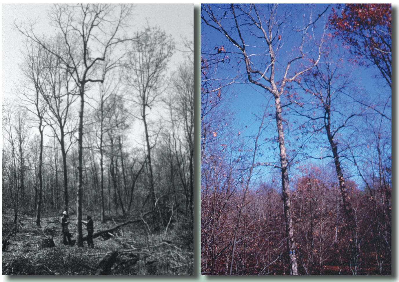
A diameter-limit harvest leaving white oak trees with little potential to increase in value. The second photo is of the same tree 15 years after the harvest. Note that the tree still retains surface defects (knots and branches) that degrades the stem. The tree grew 1.5 inches in diameter in fifteen years after release.

generally has the potential to create a better-quality stand. Methods of regeneration include clearcutting, patch clearcut, shelterwood and group selection. Most hardwood species can be regenerated by one, two or all three of these methods. The species likely to be present following the regeneration harvest will vary for each stand and will depend upon many factors including advance reproduction, seed and sprout sources.