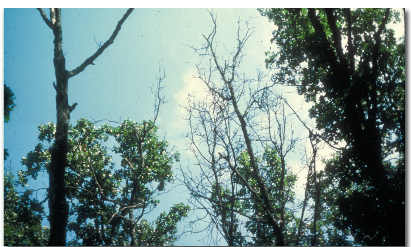
A degraded hardwood stand with oak decline.