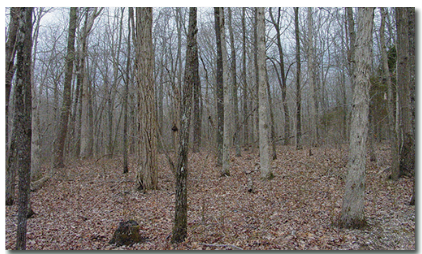
Degraded stand with a few acceptable growing stock (AGS) trees.

If a sufficient number of AGS trees are not present in the degraded stand, then the stand should be regenerated, because a new young stand