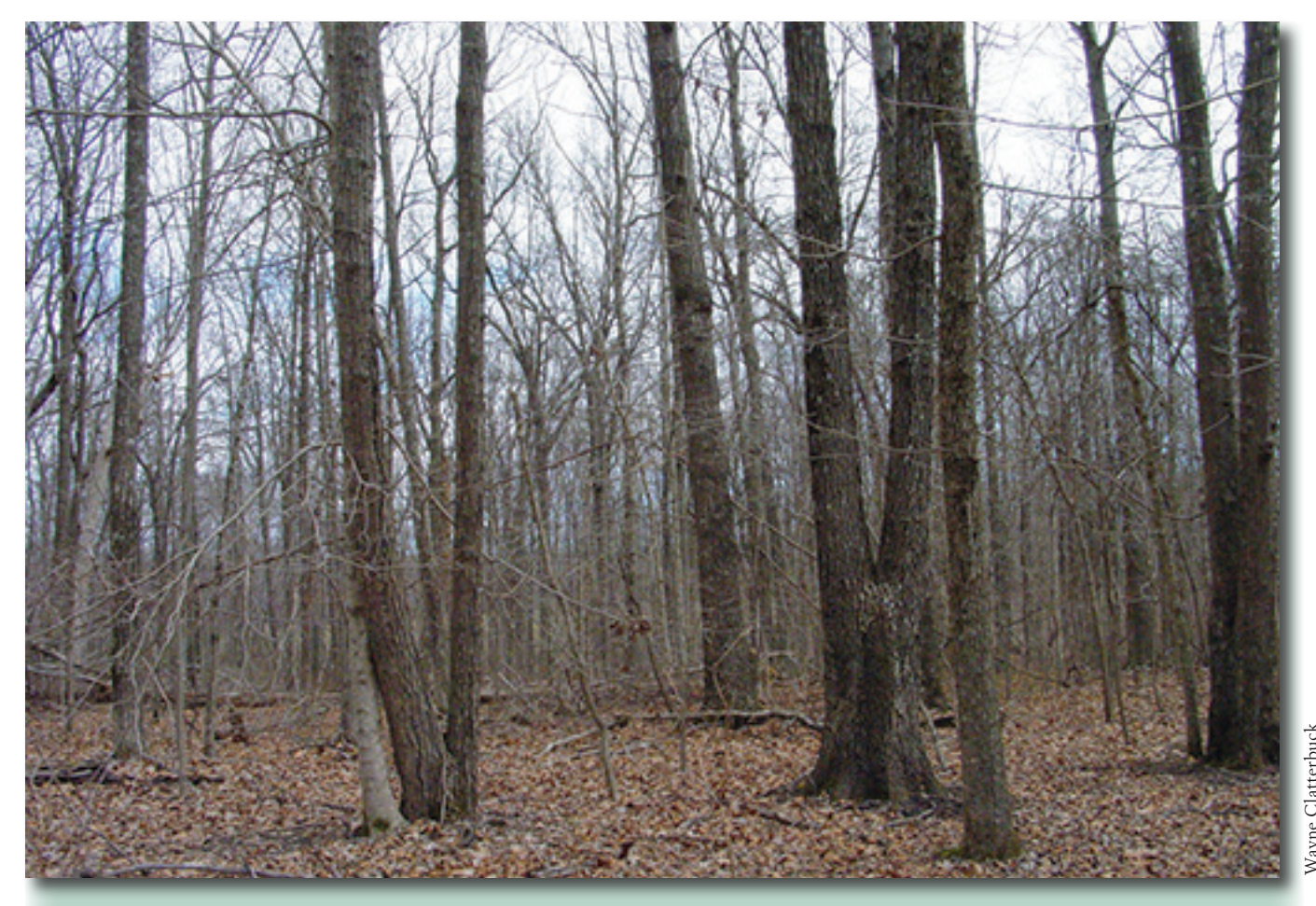
Forked and poor quality trees remaining after repeated high-grading.

and culls controlled without physically damaging the retention trees. Many smaller trees must be cut, lopped and injected, which is usually done as an expense. Once these smaller trees are controlled, then the reproduction will have an opportunity to grow unhindered. As retention trees reach harvestable size, there must be a means to harvest these trees with minimal damage to the developing reproduction.