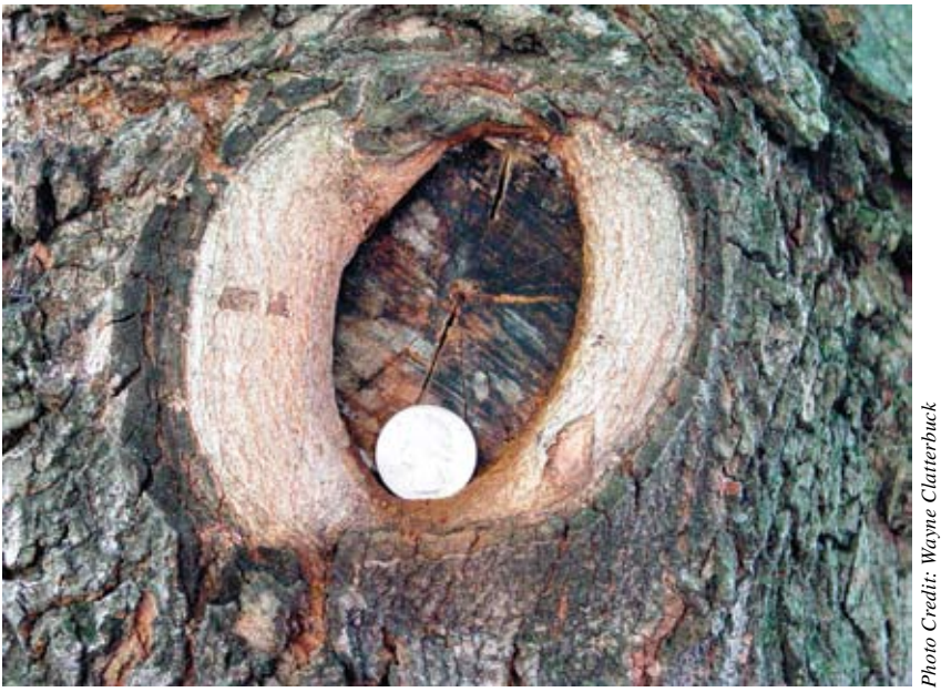
Growth of callus tissue on a pruned branch of sugar maple