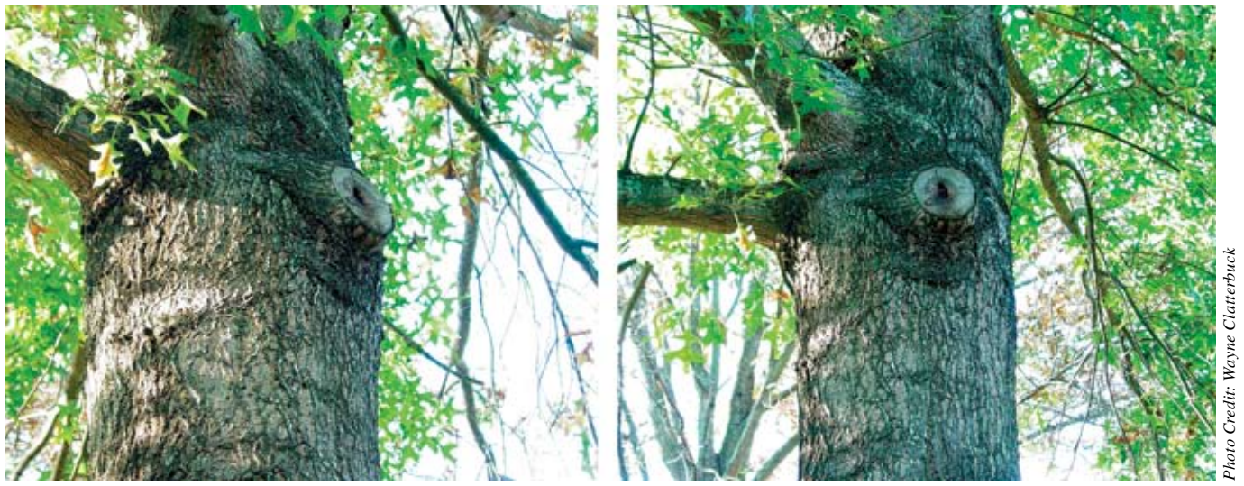
Callus growth and correct pruning of a branch on pin oak without damaging the root collar