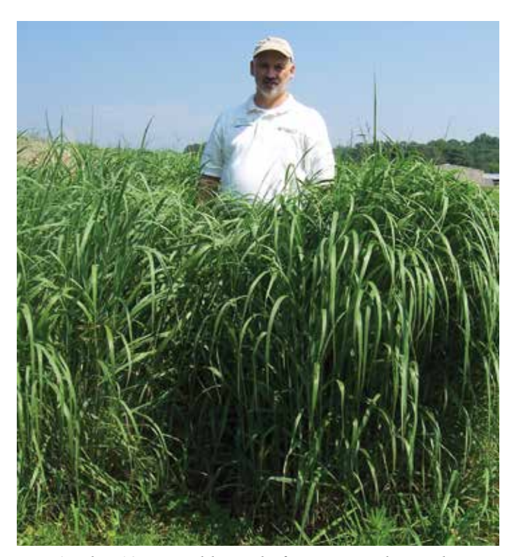
Fig. 2. This 18-year-old stand of cave-in-rock switchgrass continues to produce large volumes of quality forage.

As with any forage, hay quality is strongly influenced by timing of harvest. Harvest of NWSG at late-boot stage will typically produce hay with protein levels of 10 percent or higher. However, like most warm-season forages, NWSG will test at levels below those for coolseason forages harvested at a comparable maturity level. This is partly because proteins in NWSG do not break down as quickly during ruminant digestion and bypass the rumen; thus, they are referred to as "bypass proteins." Because bypass proteins can be absorbed in the intestines, animal performance on NWSG exceeds what we would predict based on forage sample analysis. For example, when grazed, NWSG routinely produce from 1.5 - 2.5lb of daily gain in steers (Fig. 3). Furthermore, NWSG forage quality is not diminished by endophyte fungi, a substantial problem with tall fescue.