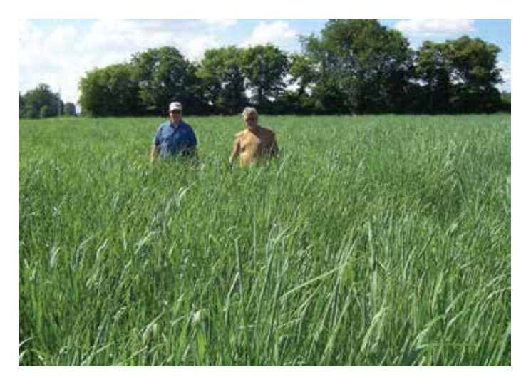
Fig. 4. Switchgrass is a tall, robust grass that produces high yields. Seedheads are open "panicles" typical of the panic grasses and appear during mid- to late-June.

Developed from plant material collected in southern Texas, Alamo is a lowland variety that is currently considered the primary species for biofuel production. At maturity, Alamo commonly reaches heights of 10 feet and can produce substantial amounts of forage. Like