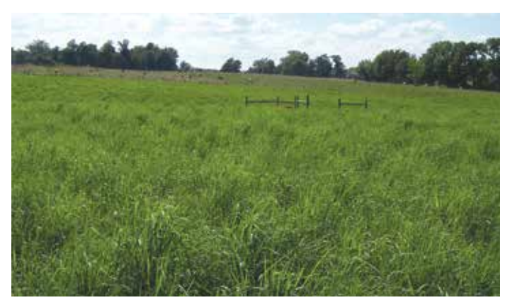
Fig. 5. Big bluestem is a fine-leaved species that produces good yields of excellent forage. Seedheads are produced in June and July and are easily recognized by their "turkey-foot" appearance.

easier to manage. It tends to mature somewhat later than switchgrass. There are many varieties of big bluestem available, but here we consider only two.