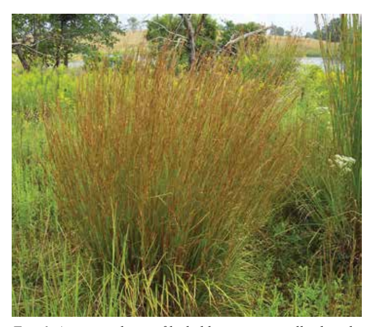
Fig. 6. A mature clump of little bluestem, a smaller bunch grass that often shows a reddish hue on its stems. Note the mature big bluestem plant in the background on the right. Despite its smaller size, little bluestem can produce desirable forages – even on poor ground.

A more recent release, OZ-70 was developed from plant material collected from a number of locations in the Mid-South. As such, it is one of the first varieties of big bluestem from this region. Like other varieties of big bluestem, it has wide site adaptation, but will not tolerate flooding as well as switchgrass.