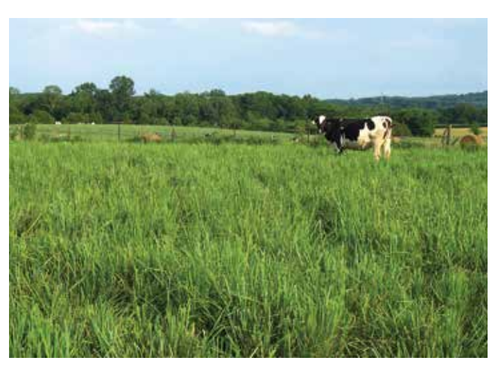
Fig. 9. Native warm-season grasses, such as this mixed stand of big bluestem and indiangrass, provide excellent grazing during the summer and provide a buffer against drought. Bred Holstein heifers (1000 – 1100 lb) gained nearly 1.9 lb per day during 2010, one of the hottest summers on record in Tennessee. Such grasses can provide a strong complement to existing cool-season grass forages.

All of these publications may be accessed online by going to: nativegrasses.utk.edu.