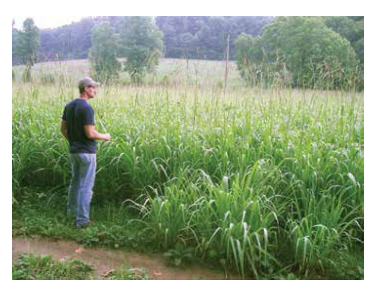
Fig. 8. Eastern gamagrass produces impressive yields of quality forage. Its seedheads appear in June and are quite distinctive.

Like switchgrass, eastern gamagrass produces very high yields and tolerates wet sites (Fi. 8). It begins spring growth sooner than the other NWSG and also maintains growth later in the season than the other species — with the exception of indiangrass. It can support high stocking rates due to its high productivity.