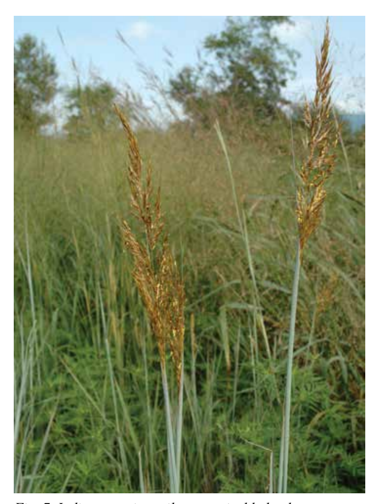
Fig. 7. Indiangrass is easily recognizable by the blueish hue of its stems and the large yellow seedheads. Indiangrass is the latest of the NWSG to produce seedheads; typically they appear in July and August.

Probably the most widely used variety in the Mid-South, Rumsey was developed from plant material from south-central Illinois. It produced yields similar to Cheyenne in variety trials conducted by the University of Kentucky.