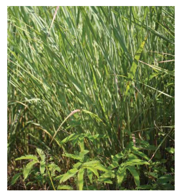
Figure 7. Partridge pea growing in a switchgrass canopy

Partridge pea is a native, reseeding annual that is tolerant to low soil fertility and complements switchgrass well (Figure 7.). Partridge pea should be planted in February to March, and it grows during the summer months. Our research indicates that the annual average nitrogen replacement value of partridge pea is 60 lbs per acre. However, as cattle forage, there may be limitations relating to palatability because seeds can cause irritation in the digestive tract if consumed in large quantities. As such, its primary value may be in biofuel production.