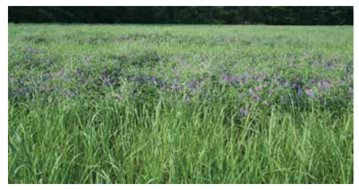
Figure 8. Hairy vetch growing in a switchgrass field

Hairy and common vetches are legumes that occur naturally throughout the South and are frequently found growing on roadsides and in fields and pastures (Figure 8.). They are well-adapted to moderately to well-drained soils. These vetches reseed readily for many years and will colonize low-fertility soils. No seedbed preparation is needed, and seed is usually no-till drilled 1/2 to 3/4 inch deep. Common vetch has less hard seed than hairy vetch, making it less of a potential weed problem, but it may require seed scarification. In a seed dormancy study, we determined that common vetch hard seed can be reduced by mechanically scarifying the seed coat, but such measures can be time-consuming. In addition, common vetch matures 10-14 days earlier than hairy, lessening competition with NWSG. Our research has measured fixation rates of 53 to 67 lbs N per acre for both vetches; thus, the addition of N fertilizer for grass growth is not necessary. Hairy vetch makes high-quality hay. However, because of its climbing growth habit, it may compete with and weaken NWSG stands and invade nearby fields. This can be mitigated through appropriate seeding rates (Table 1) and timely spring grazing. In some cases, mowing may be needed to manage excessive vetch competition.