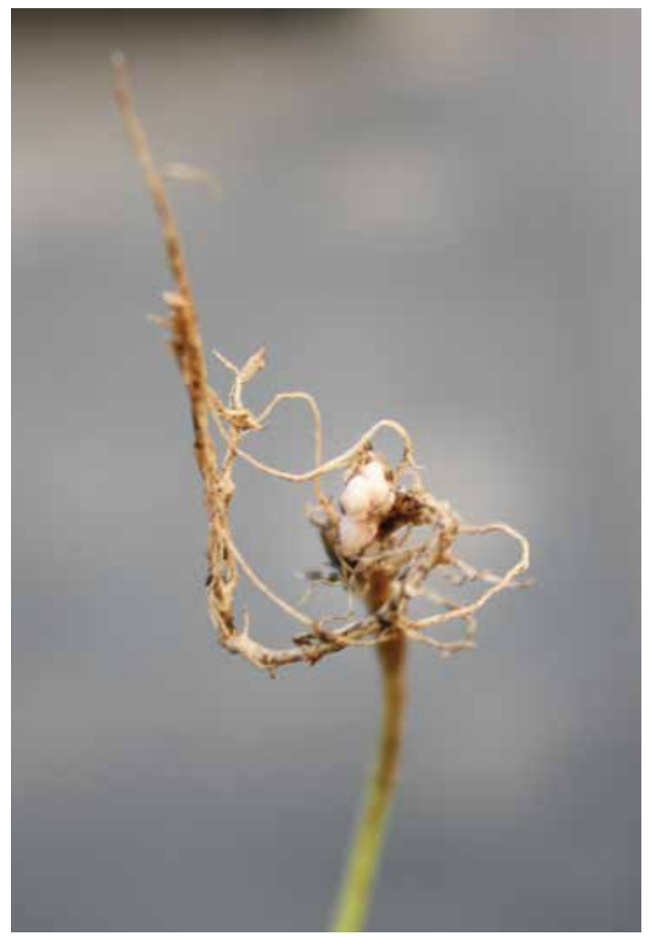
Figure 9. Nodules on legume roots (pink color indicates leghaemoglobin, an iron containing protein that converts nitrogen gas to a plant-usable form [ammonia])

Seeds that come preinoculated have a stronger sticker and are often rolled in limestone or rock phosphate, which combats unfavorable conditions, such as low pH and temperature extremes, and can be stored for longer periods. Lastly, do not inoculate seed directly in the planter box, because inoculant and seed tend to separate when dry, leading to uneven seed coverage.