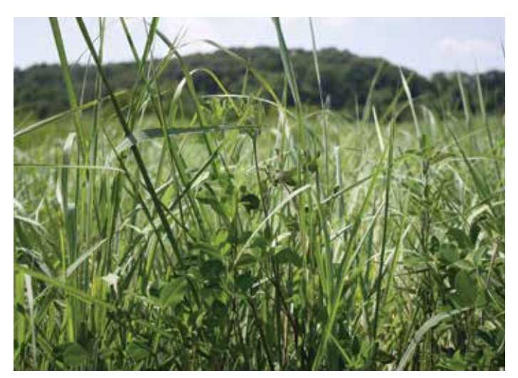
Figure 2. Switchgrass and clover growing together before a forage harvest in Tennessee

Primary considerations when selecting legume species include planting date, field history and soil drainage. Seeding dates for cool-season legumes in the Mid-South are typically early fall and mid-February through March.