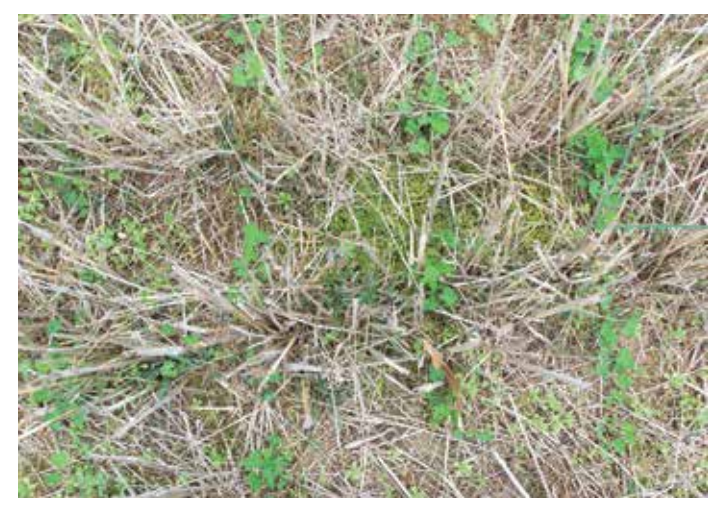
Figure 6. Clover seeded into NWSG stubble during grass dormancy

Crimson clover flowers earlier in spring than other clovers and produces high yields even in cool winters but has a shorter grazing season, maturing in late April. Crimson clover can be planted with a drill, a cultipackerseeder, or can be broadcast from late August to October (Figure 6.). Crimson clover grows well in both sandy and clay soils that are well-drained and performs better than most other clovers on poor sites. Seeding depth should be 1/4 inch. In a reseeding experiment conducted at the University of Tennessee, crimson clover and red clover had the highest densities after annual reseeding. However, crimson clover stands that are well-established in the fall can be too competitive with NWSG in the spring; therefore, it is important to plant at a reduced seeding rate (for specific rates, see Table 1).