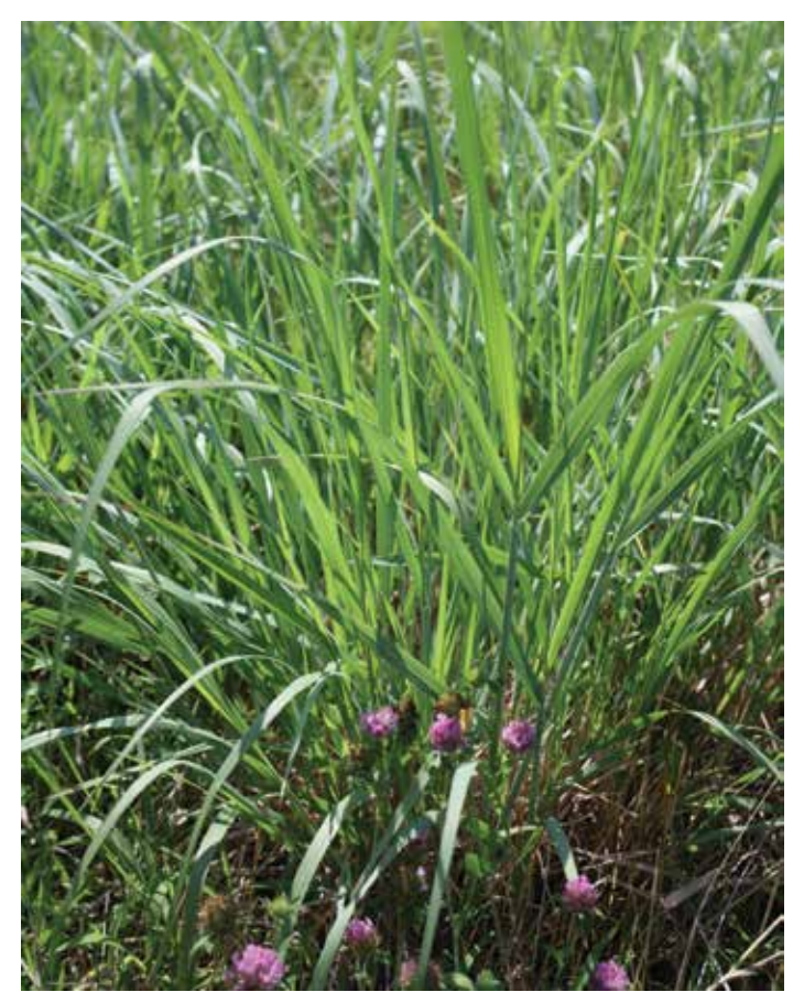
Figure 4. Red clover flowering in a switchgrass pasture

with respect to establishment and persistence during trials at the University of Tennessee.