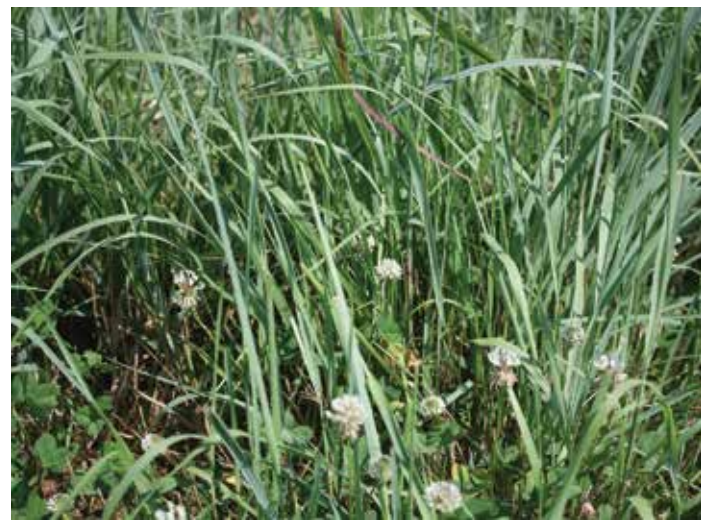
Figure 5. White clover growing in tandem with switchgrass at a proper density

White (or ladino) clover is a cool-season legume that grows well over a variety of soils and climates; however, it prefers cool and wet conditions. White clover will grow in soils considered too acidic for red clover (Figure 4.) and alfalfa. This long-lived legume can be seeded February through April or August through September to a depth of 1/4 inch. The two greatest concerns when using white clover is its inability to survive extended dry periods and the potential for it to cause bloat in grazing livestock; however, any clover has the potential to cause bloat if it is not mixed in a grass stand where availability is reduced. In studies underway, switchgrass pastures that were interseeded with white clover yielded equivalent hay compared to 30 and 60 lbs N per acre.