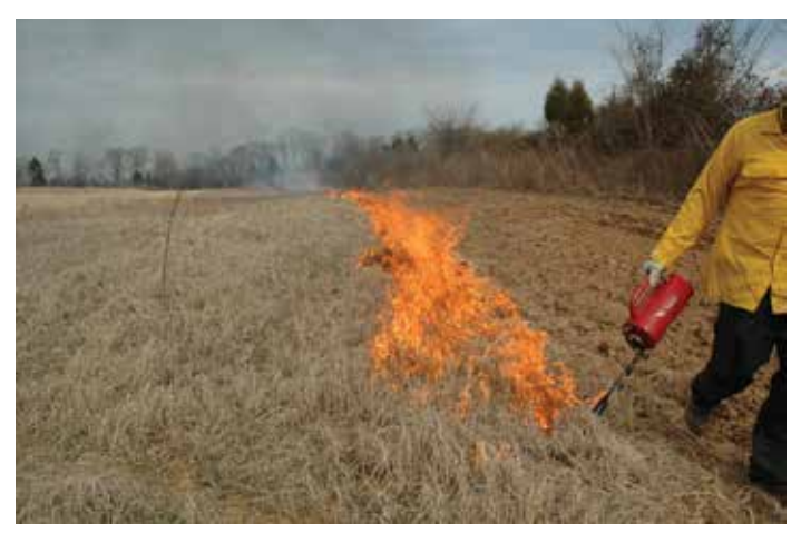
Figure 9. Prescribed fire rejuvenates NWSG growth and enhances the structure at ground level for several wildlife species, including northern bobwhite.

No discussion of grasslands and associated wildlife would be complete without mentioning area requirements. Most grassland bird species require relatively large tracts of grasslands. Small fields in a landscape dominated by forest will not attract species such as eastern meadowlark and grasshopper sparrow, regardless of grass type or management. Field size also is influential. Henslow's sparrows and eastern meadowlarks may be found in relatively small fields (10-20 acres and larger), whereas grasshopper sparrows are found more often in larger