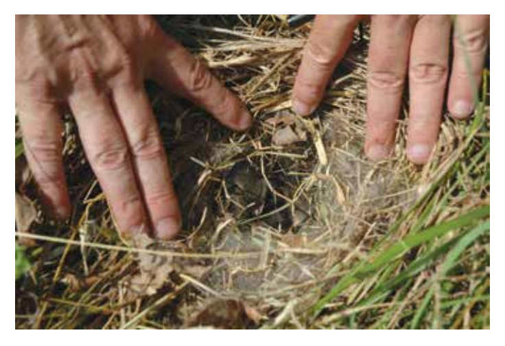
Figures 5a and 5b. Eastern cottontails may use NWSG hayfields for nesting (left) and winter cover (right), provided there is sufficient overhead cover.