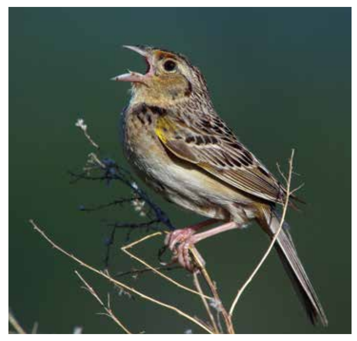
Figure 2. Haying during the nesting season can lead to population declines of grassland songbirds, such as this grasshopper sparrow.

May) or switchgrass and eastern gamagrass (mid- to late May). The timing of haying has important implications for wildlife, especially nesting birds.