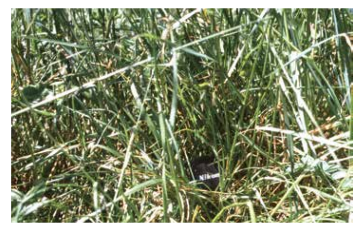
Figures 4a and 4b. Structure at ground level is a major consideration for several wildlife species, such as northern bobwhite. The open structure presented by NWSG (left) allows movement and feeding within the field, whereas the structure provided by tall fescue (right), orchardgrass and bermudagrass restricts use by many species.