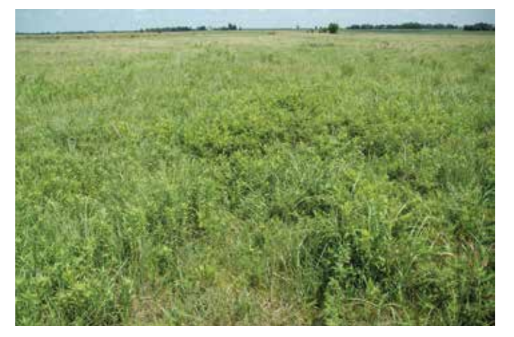
Figure 10. Grassland birds require open landscapes. Do not expect to find grassland birds using small fields in areas dominated by forest.