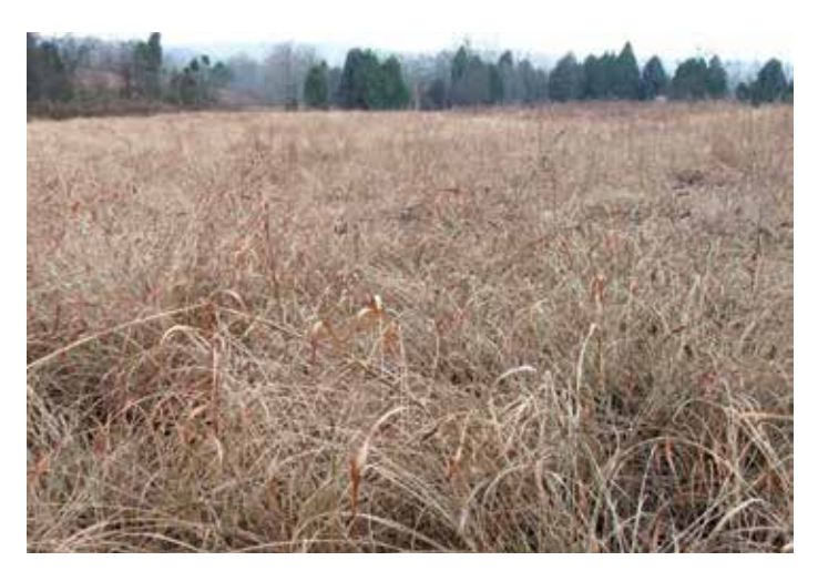
Figures 6a and 6b. The big bluestem/indiangrass field on the left was hayed twice with the second cutting in September. The big bluestem/indiangrass field on the right was hayed once in late June. The regrowth from September until dormancy is not enough to provide winter cover, whereas the regrowth from late June until dormancy provides good winter cover for grassland birds.