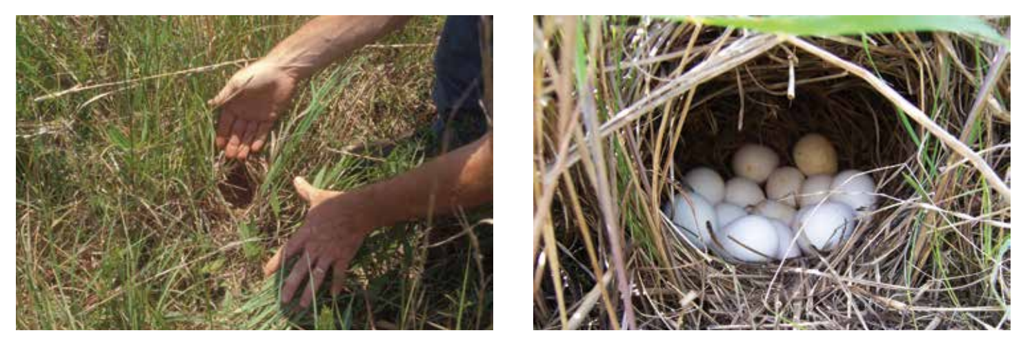
Figures 8a and 8b. Eastern meadowlark (left), northern bobwhite (right) and grasshopper sparrow all construct their nests on the ground. Nests are usually made of dead grass leaves from the previous year.

Duration of grazing is an important consideration for continued grass productivity as well as winter cover for migrating and wintering birds. Optimally, NWSG should not be grazed past early August to allow sufficient growth for winter cover. At this point, livestock grazing NWSG can be moved to CSG pasture that has rested through the summer.