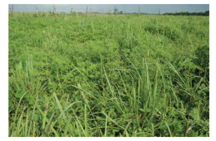
Figures 7a and 7b. NWSG grazed properly looks differently than the intensively grazed CSG, which is ubiquitous across the Mid-South region. Notice the height of the forage and the open space near ground level. This type of structure is critical if wildlife is a consideration. The presence of various forbs, such as this red clover and ragweed, not only adds livestock forage value, but also enhances the structure and food availability for wildlife.