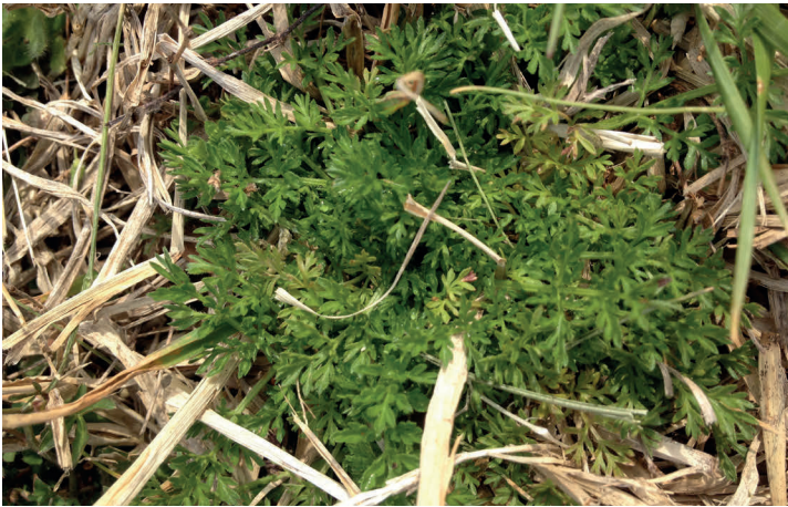
Figure 10: Parsley piert ( Aphanes arvensis ) leaf shape and arrangement.

For more information regarding winter annual broadleaf weeds in turfgrass, see University of Tennessee Extension publication W 205 available at extension.tennessee.edu/publications/Documents/W205.pdf .