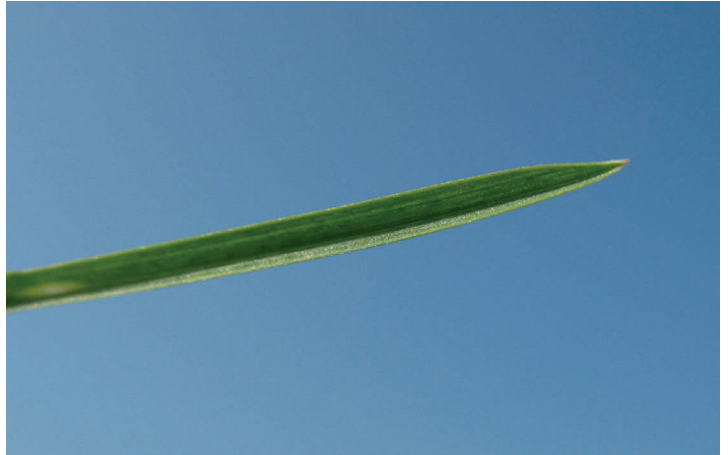
Figure 4: Boat-shaped leaf tip of annual bluegrass ( Poa annua ).