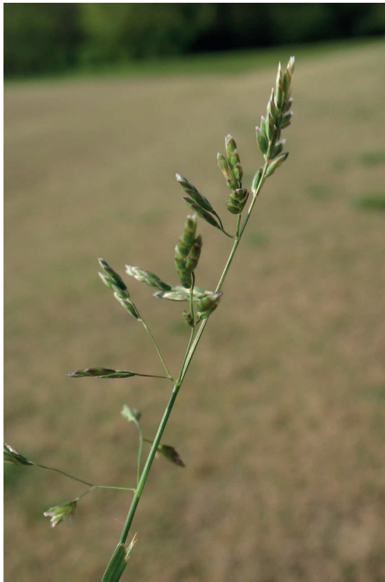
Figure 5: Poa annua seed head.