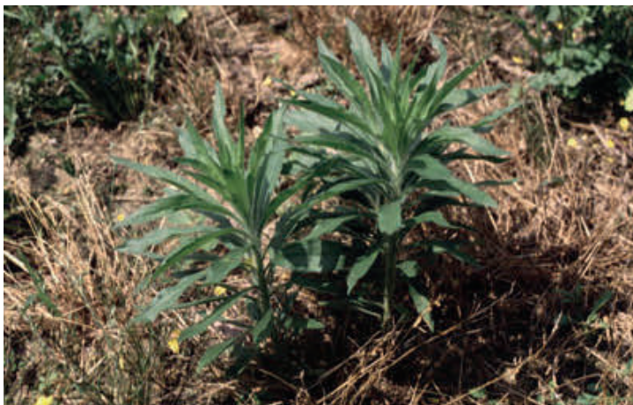
Figure 7: Horseweed ( Conyza canadensis ).

Horseweed leaves have no petiole and are toothed. Plants have a central taproot that produces a fibrous root system. The flowers are small and white; however, the species does not often produce flowers under conditions found on a putting green. When mature, horseweed is easily identifiable (Figure 7). However, the juvenile rosette stage commonly observed on dormant ultradwarf bermudagrass putting greens is often confused with Sheperds-purse ( Capsella bursa-pastoris L.) and several other rosette forming plants (Figure 8).