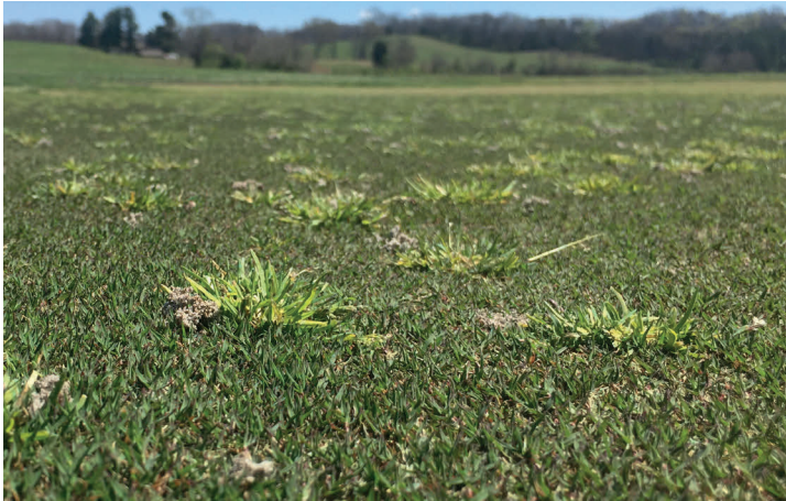
Figure 3: Bunch type of growth of annual bluegrass ( Poa annua ) infesting ultradwarf bermudagrass ( C. dactylon x C. transvaalensis ).

Poa annua morphology can be highly variable. However, most often plants exhibit a bunch-type growth habit and form distinct patches or clumps (Figure 3). The leaf blade is folded and has a boat-shaped tip (Figure 4). Each ligule is long, membranous and slightly pointed ligule. Plants produce a panicle-type seed head that is triangular in shape with spikelets bunched toward the ends (Figure 5). Seed heads start to emerge in the spring and viable seed can be produced in just a few days after pollination (Figure 6). This feature allows for the production of viable seed, even in situations like putting greens where turfgrass is frequently mowed at low (less than 0.125 inches) heights of cut.