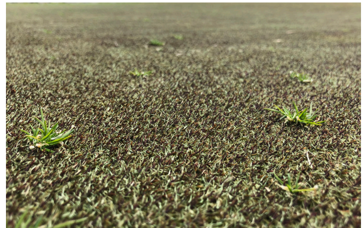
Figure 2: Poa annua infesting ultradwarf bermudagrass ( C. dactylon x C. transvaalensis ).