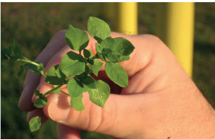
Figure 9: Common chickweed ( Stellaria media ) leaf shape and arrangement.

Common chickweed has a shallow root system and is often found in wet, shady turfed areas. Leaves are opposite, shiny and egg-shaped to elliptic (Figure 9). The uppermost leaves have no petiole. Common chickweed is easily identified by the lines of vertical hairs that are present along the stem. Common chickweed is similar in appearance to mouse-ear chickweed ( Cerastium vulgatum ); however, mouse-ear chickweed is a perennial that roots at the nodes, and has oblong leaves with prominent hairs.