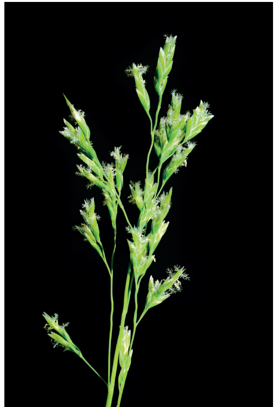
Figure 6: Poa annua pollination.