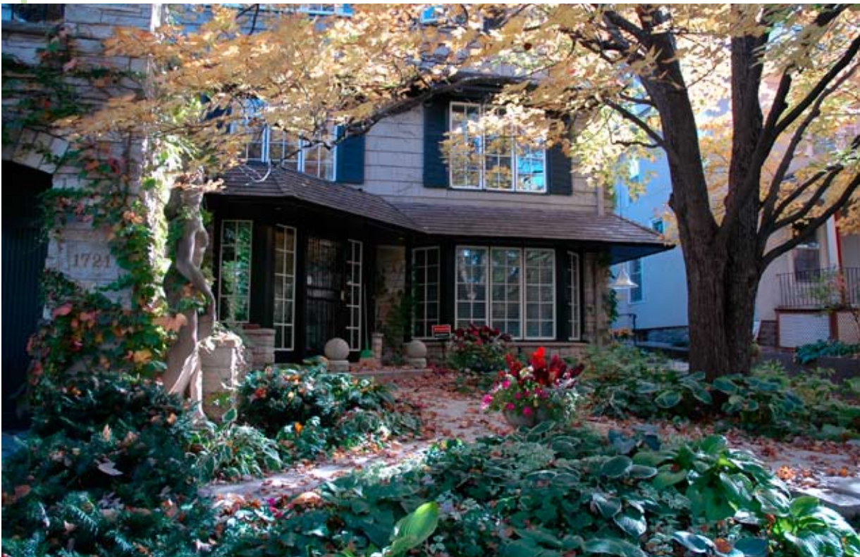
Diversity of plant materials creates a welcoming, warm garden.