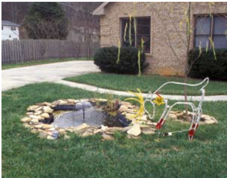
A poorly designed pond may actually reduce property value.

There was a time when a backyard pond was cutting edge. This eventually evolved into the story of the “stone necklace.” You may have seen these or may even have one. The stone necklace is the term given to the ever present rock-ringed garden pond. The stones are initially placed around the perimeter of the pond to conceal and / or anchor the flexible liner. The result is a water feature with perhaps pleasant sound but appearing anything but natural. If you have one of these situations, consider installing a few crawling plants in a few key areas around the edge to help conceal some of this stone. Adding a bog (shallow, consistently wet planting area) to one end may also help mitigate some of the stone.