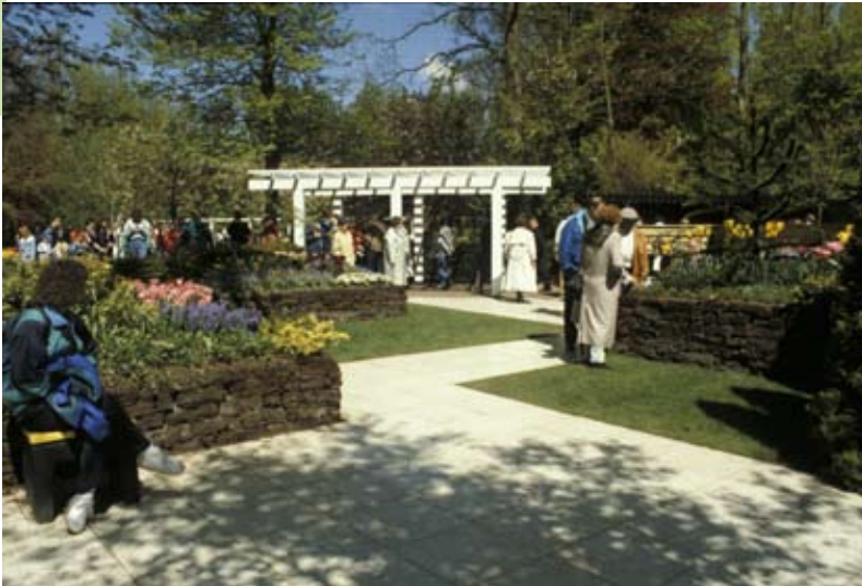
Straight lines can be just as appealing as curved lines.

If you have a smaller, rectilinear backyard, try rotating your viewing axis to take advantage of the longest measurement (see diagram on right). By doing so, you will inadvertently create some fantastic opportunities for developing some creative subspaces. Very often our landscapes are bound by geometry, considering the adjacent structures, property lines, walkways and such. We too often feel compelled to force a curve into an area in which it makes very little sense. Be creative, bold and daring. Try a straight line now and then.