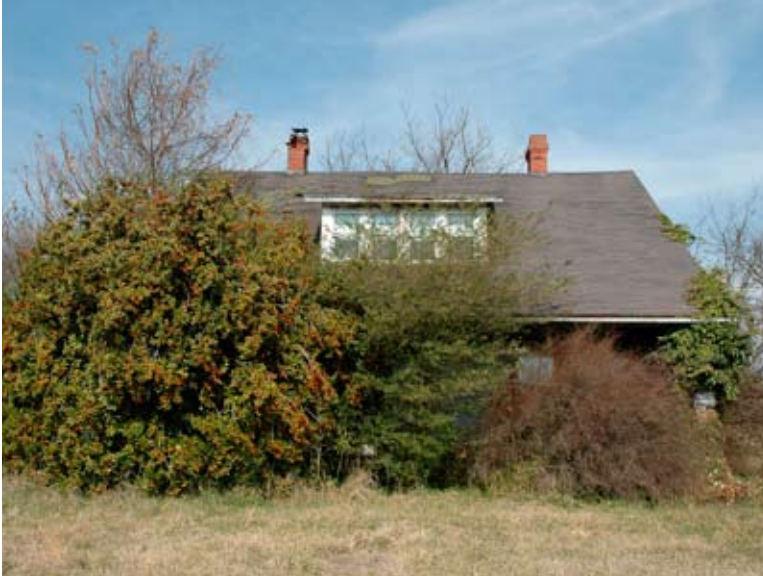
An overgrown landscape in need of a make-over.

The final “mistake” in this list is the notion that so many garden lovers can’t help but to try to keep their properties in some frozen moment in time. Plants grow, thrive and die. A garden is constantly changing. The sun-loving dianthus planted under the canopy of that small sugar maple will eventually have to be replaced with more shade-tolerant hostas, ferns or mondo grass.