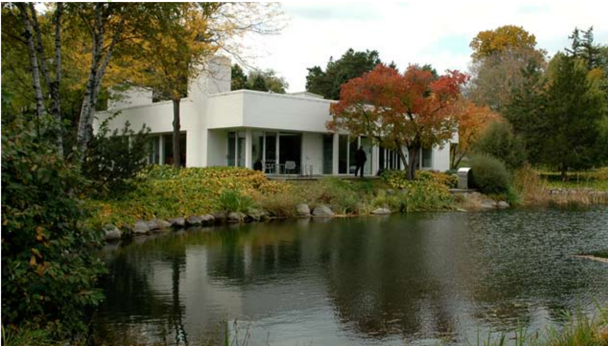
An attractive landscape continues to evolve and appeal to many with proper maintenance.

This list is by no means complete. There are surely things you have witnessed in your travels that if it were yours, you would have done differently. What has been written here should serve only as a guide or perhaps a little jolt to get you thinking about creating that next beautiful garden paradise.