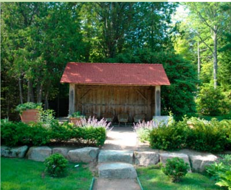
Comfortable "rooms" can be created by dividing a larger space.

One of the greatest compliments one could receive on his or her garden would be to have a visitor return after several visits and discover a "secret garden" and then respond by saying, "In all my visits here, I never knew this existed." Just as in any good card game, you should not show all of your cards at once. Another way of putting this would be "reveal and conceal." Create mystery in your garden and allow visitors to explore and discover new plants and features.