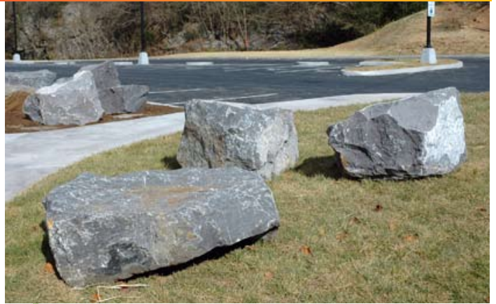
Boulders resting on the landscape look unnatural.

Boulders in the garden can add an amazing, natural architectural dimension. Unfortunately, a very common problem occurs when these gifts from the earth are placed haphazardly on the landscape. You may have witnessed The Great Rock Drop. You have likely seen these abnormalities where accent boulders aren't nestled into the beds, but just placed on them. To be successful (look natural,) boulders should be planted. They should be buried up to the point of their widest measurement. Whenever you can see a boulder angle back towards its center, it's pretty easy to estimate its total mass. Ideally, you'd like these features to replicate natural rock outcroppings where one passing by sees only the tip of the iceberg.