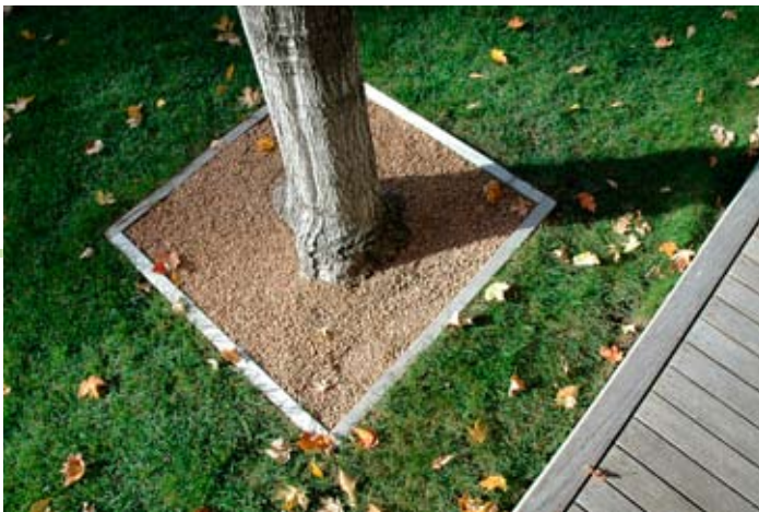
Crisp edges add contrast to lawns and paths.