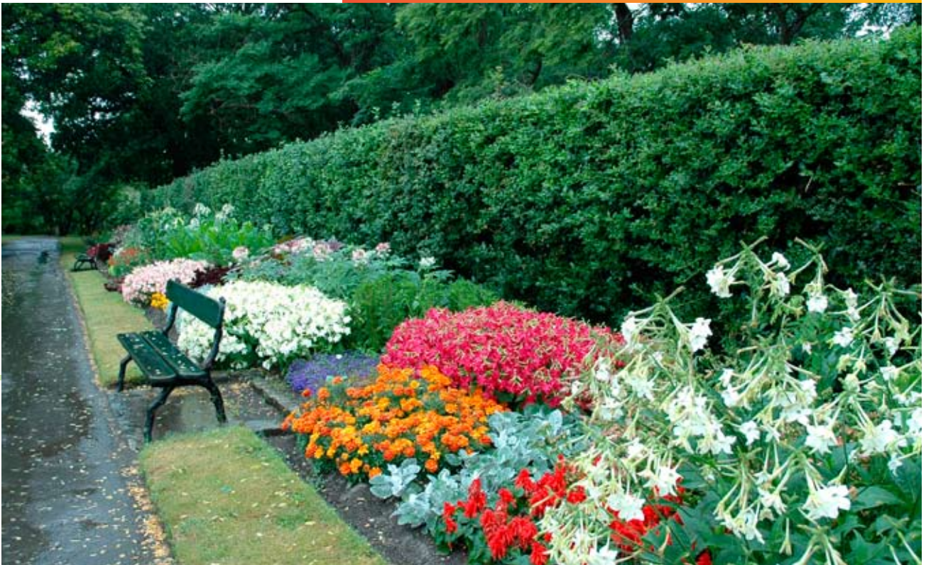
A simple hedge provides welcome continuity in this garden.