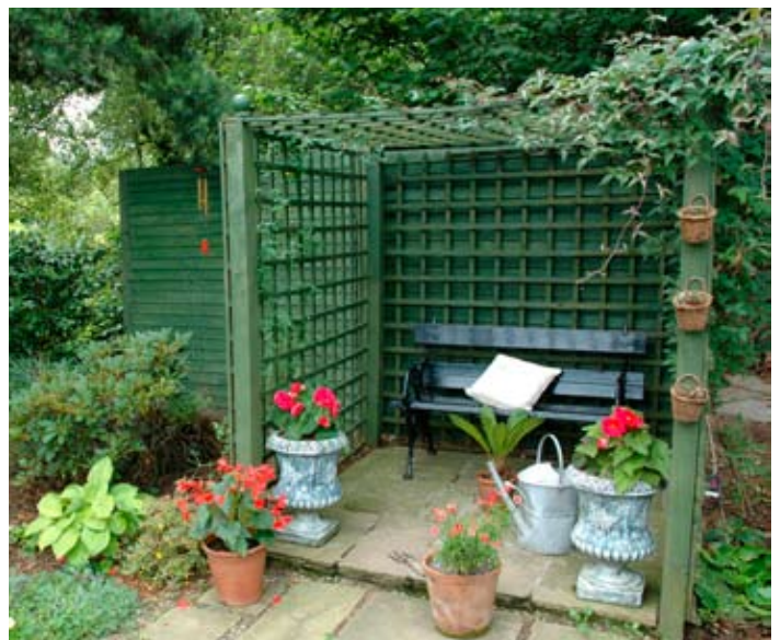
Architectural elements add structure to gardens.