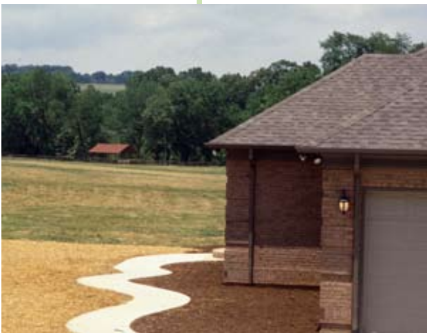
Too many curves lead to chaos.

Somewhere in the history of American landscape design, someone must have been quoted as saying “curves are soothing and make us feel more relaxed.” While this is no doubt true in many instances, why must they dictate the design of every bed and pathway in our gardens? Geometry can be a beautiful thing. A modern home with exciting architectural angles should not have its landscape conform to the status quo.