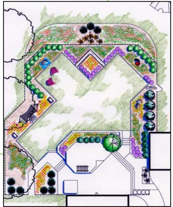
This geometric design takes advantage of the backyard's longest measurement which creates some inviting sub-spaces.