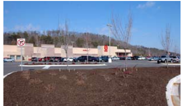
Too much mulch provides no contrast.

This would be an ideal situation to install a narrow band of turf to serve as a transition from bed to walk. By having such an intermediate texture, the scale of the bed is kept in check and the entrance garden may look much more inviting. You may have experienced a similar instance where a shopping center attempts to keep maintenance down by simply mulching enormous areas that were really meant to be planted or have turf. More than