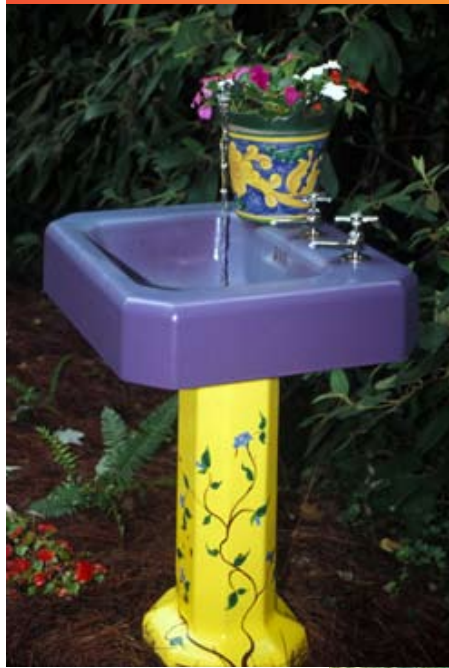
Interesting water features give gardens a unique identity

If the idea of moving water without the maintenance of pond, fish and plants appeals to you, consider a pondless water feature. The idea here is to showcase some strange piece of yard art or a beautiful urn in which water flows, eventually draining into a small, underground reservoir housing a compact, re-circulating pump. There is no open, standing water in this case, thus keeping mosquitoes and algae at bay.