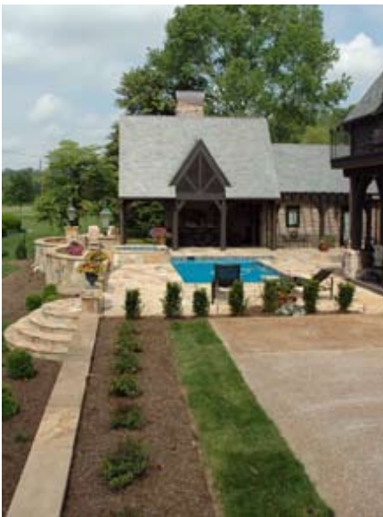
A narrow band of turf creates a good transition from hardscape to bed.

This would be an ideal situation to install a narrow band of turf to serve as a transition from bed to walk. By having such an intermediate texture, the scale of the bed is kept in check and the entrance garden may look much more inviting. You may have experienced a similar instance where a shopping center attempts to keep maintenance down by simply mulching enormous areas that were really meant to be planted or have turf. More than