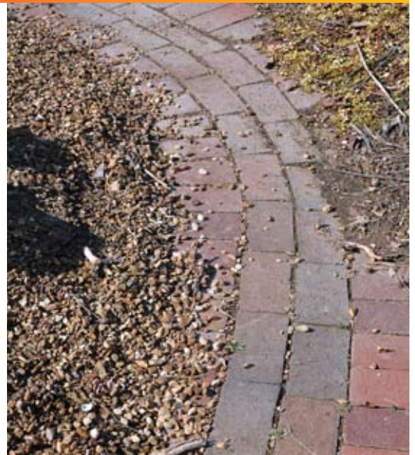
Lack of edging creates a poor division of elements.

Just like architectural lines on a building, different elements in a garden need to be crisp and well-defined. Along a crushed stone pathway, this may consist of installing an extra material such as a steel edge. Where turf meets beds, it is often necessary to delineate this transition with brick, stone or thin strips of pressure-treated wood. If using a natural, trench-type edge, be sure to re-cut this every so often so that the two materials do not blur. The next time you visit a botanic garden or well-designed landscape, pay attention to edges. See what's out there and don't be reluctant to bring some of those ideas back to your own yard.