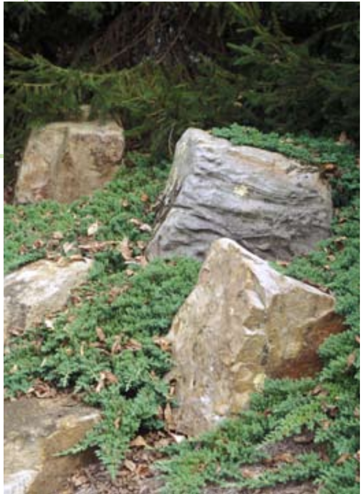
These rocks look settled and are an integrated part of the design.