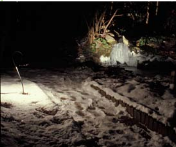
Good lighting will transform a garden.

Low-voltage lighting can also be very flexible. Since the wires are not fixed in conduit, fixtures may even be moved (provided there is enough slack wire) to cast a glow upon different plants and special garden features as the seasons change. When placing light fixtures in the garden, just remember that not everything needs to be lighted. Having too many hot spots of light can be as chaotic as having too many specimen plants in a small area, creating competition and confusion. There is more information on landscape lighting available on the Internet and in specialized how-to books in where you may get more detailed guidance.