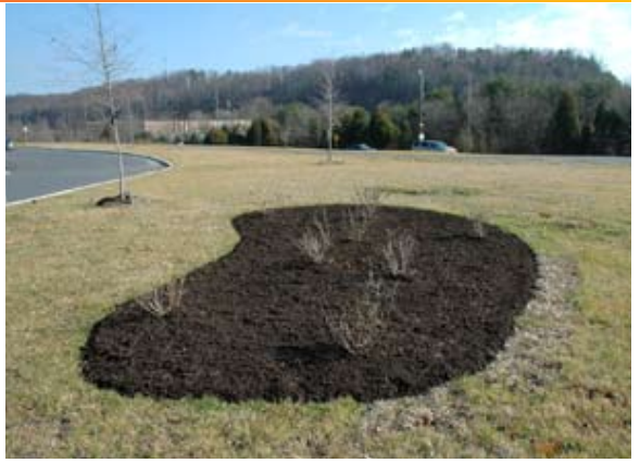
The ever-present bean-bed.

Relating to the previous challenge of the missing edge, inappropriate bed scale also presents a dilemma when designing and laying out a landscape. A good example to help illustrate this would be to picture that ever-present walkway connecting the driveway to the front door. Very often, this may be 12 feet or more from the foundation of the home. In order not to have to maintain lawn in this area, the foundation bed is allowed to continue uninterrupted to the walkway. Unless one has densely planted and well-maintained groundcover, the result of this situation is similar to what was described previously, with mulch or debris being kicked out on to the walkway.