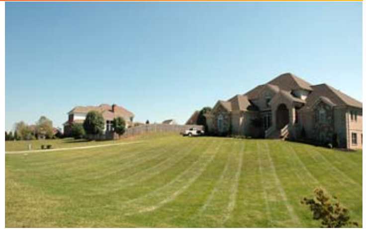
A vast property with an overwhelming sense of scale

A solution may be to pull this entire planting closer to the edge, to not only better define the lawn area, but also serve as a visual boundary to the front or back yard. You should strive to design a well-defined area of turf and then plant heavily around the perimeter. Here's one way to look at it. "The shape of the lawn is often more important than the shape of the beds." This also helps create a more pleasing perspective from views inside the house by giving the viewer's eye more to see from key windows than just grass and a couple of trees. With the proper backdrop, you could create more contrast, which is key to any pleasing garden.