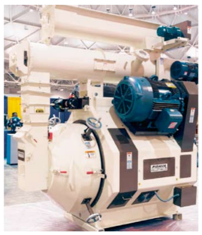
In a pellet mill, large electric motors compact wood particles and extrude them as pellets through small openings in steel dies.