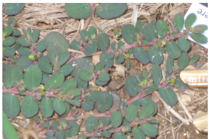
Figure 5. Prostate Surge