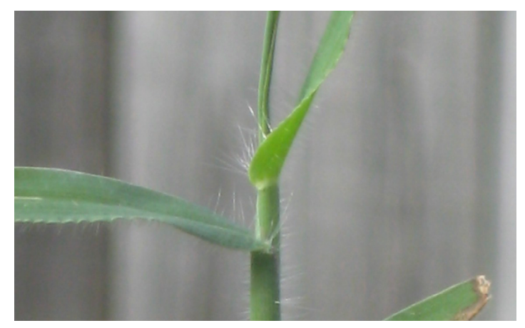
Figure 1. Large Crabgrass