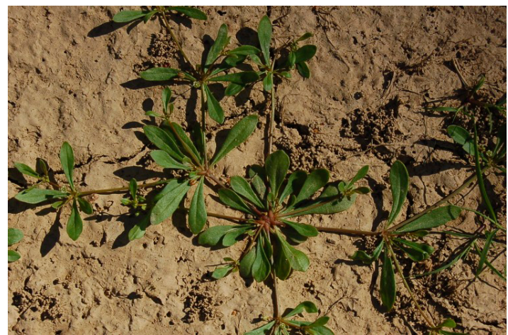
Figure 4. Carpetweed