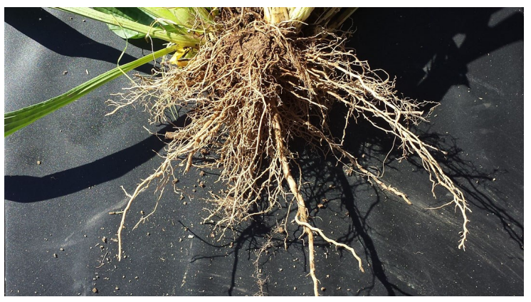
Fig. 4. Fibrous roots from a taproot.