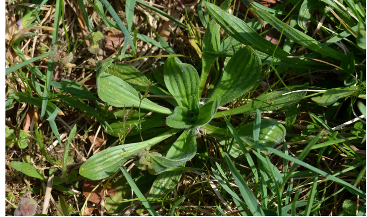
Fig. 2. Rosette growth form.