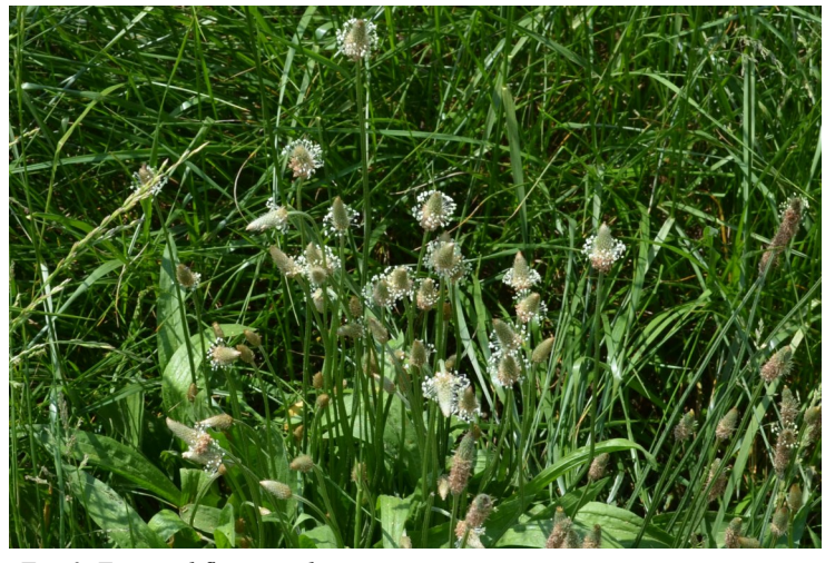
Fig. 3. Terminal flower spikes on stems.