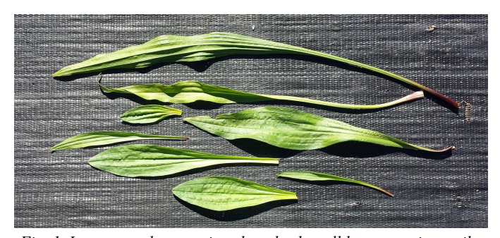
Fig. 1. Leaves can have various lengths, but all have prominent ribs.

Although buckhorn plantain is not toxic to cattle and somewhat palatable, it can increase in density over time and compete with desirable forages. Older plants can become highly drought-tolerant due to the long taproot. Also, plants can regenerate from the taproot even when cut off at or below the soil surface. Due to its persistence and short growth habit, buckhorn plantain can become well established and difficult to control in pastures.