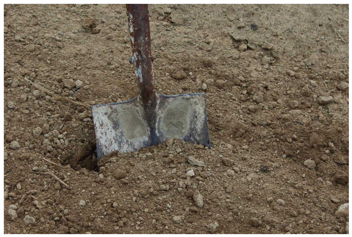
Figure 1. Medium textured soil that is workable for at least 6 to 8 inches is most desirable for gardens.