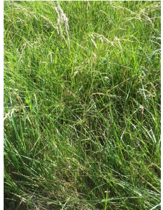
Figure 2: Tall Fescue Grass ( Festuca arundinacea )

Treatment is available for broodmares who have ingested tall fescue. Domperidone can be given and improves milk production. It also stimulates prolactin production. This drug should be given two weeks before foaling and continued two weeks after foaling. A veterinarian should be consulted before administering medication. Although consumption of fescue is not lethal, the best practice is to keep pregnant mares off the grass. Pregnant mares should be taken off fescue grass or hay 30 days prior to breeding and at least 60-90 days before foaling. Mare and foal should be kept off fescue until the foal is weaned.