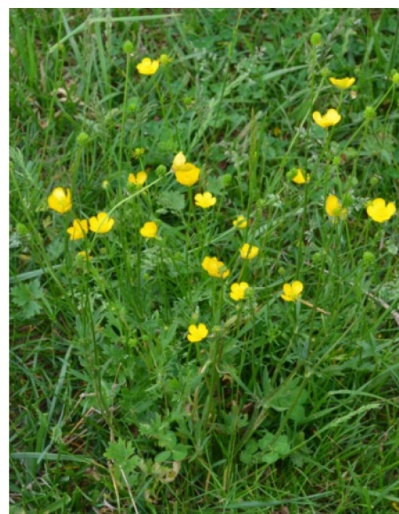
Figure 1. Buttercup ( Ranunculus spp.)

Buttercup poisoning is easily treatable by removing the horse from the source. Dermatitis caused by the toxin should be treated with an antibiotic cream. Contact your veterinarian to create a treatment plan. Pastures can be sprayed for buttercups when they are actively growing before they flower. If buttercups are not able to be removed from the pasture, make sure adequate hay is provided to reduce temptation to graze on buttercups.