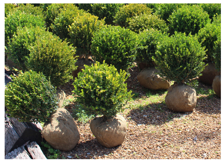
Figure 6. Boxwoods should be isolated for two to four weeks and observed for symptoms before planting.