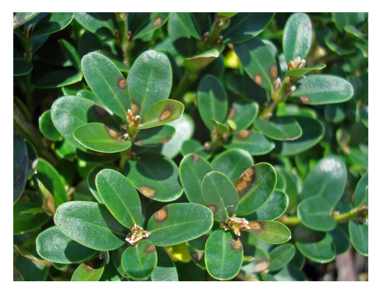
Figure 1. Symptoms of boxwood blight are large, circular necrotic lesions with purple-to-black borders.

The main symptoms of boxwood blight are leaf spots, twig lesions and leaf drop. Boxwood blight does not infect large stems or branches, or roots.