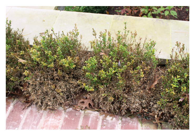
Figure 3. Severe infections occur when the environment is favorable for disease development. Infected leaves turn tan to brown and remain on plants.

Large areas of blighted leaves and severe leaf drop can occur when conditions are favorable for infection. When scouting boxwoods for boxwood blight during winter months, look for twigs with few leaves and small black lesions. If conditions have been particularly favorable for disease development, infected leaves will turn tan to brown and remain on the plant.