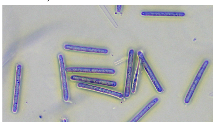
Figure 4. Rod-shaped spores of Calonectria pseudonaviculata, the causal fungus of boxwood blight..

The fungus that causes boxwood blight produces rod-shaped spores in bundles on leaf spots and twig lesions (Figure 4). Spores are moved short distances via splashing rain and irrigation. Because spores are sticky, they may be moved on clothing, garden tools, pets and wildlife. It is also possible that boxwood blight may be dispersed by leaf blowers, as infected leaves are dispersed over a wider area. The causal fungus may also contaminate pruning tools used to prune and shape boxwoods. In addition to spores, the fungus produces spear-shaped vesicles that aid in identification (Figure 5). Calonectria also produces structures called microsclerotia, bundles of tightly bound hyphae, which help it survive in soil for several years.