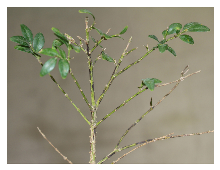
Figure 2. Severe infections of boxwood blight lead to defoliation and purple-to-black lesions on green twigs.