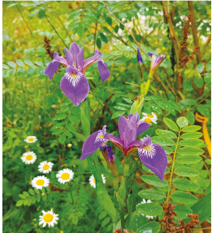
Figure 1, Irises. A combination of moist soils and part shade along with a desire for long bloom time and a consistent texture make one of Tennessee's official state symbols a perfect selection. Native Blue Flag Iris grows under a sprawling Indigo Bush below a gutter downspout.

Will the plants you choose still fit the space in 5 years, 10 years?