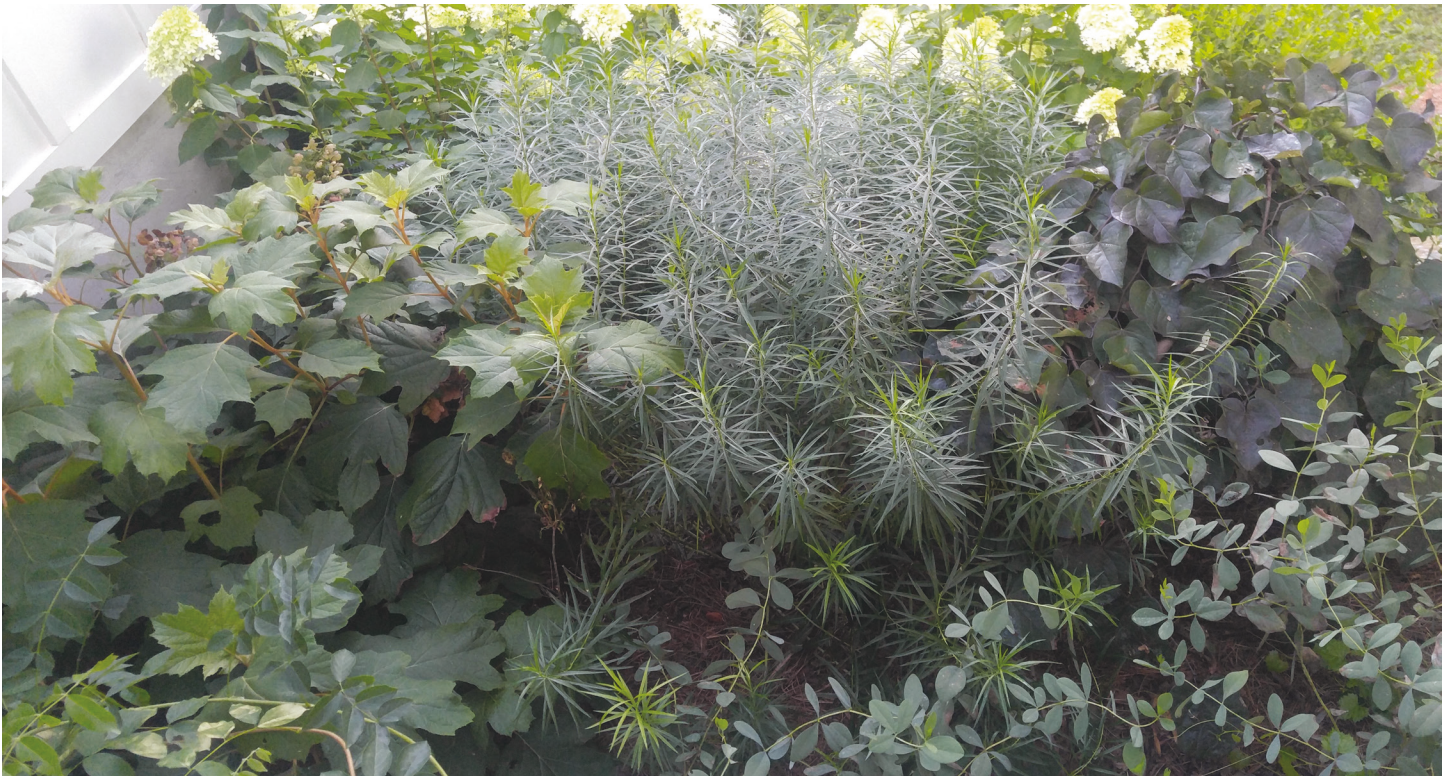
Figure 2. Plant Diversity. Use a diversity of plants to create unique visual appeal, ward off large scale loss from disease or pests, and provide a variety of benefits for wildlife. Here, native oakleaf hydrangea, needle-leaved bluestar amsonia and false indigo are paired with an Eastern Redbud variety selected for contrasting foliage colors.

in developed land in Tennessee. Currently, over 3 million acres are dappled with buildings, roads and parking lots (TACIR 2011). With Tennessee population expected to reach nearly 7.4 million by 2030 (CBER), land development will certainly continue at a fast pace into the future decade.