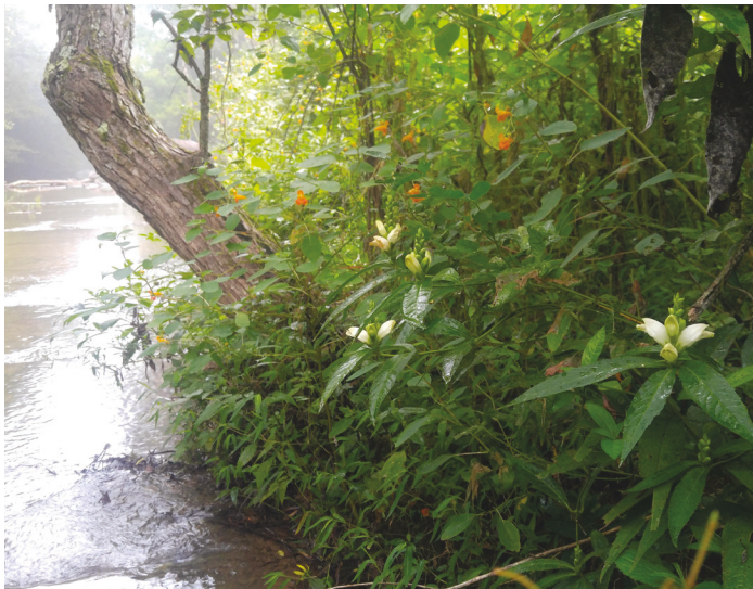
Figure 4, Riparianbuffer. A walkway through lush vegetation along a creekside (called a riparian buffer) allows for easy viewing of the creek and these white turtlehead and orange jewelweed. These plants, along with the canopy maples, provide shade to the stream and help reduce the risk of stream bank erosion.