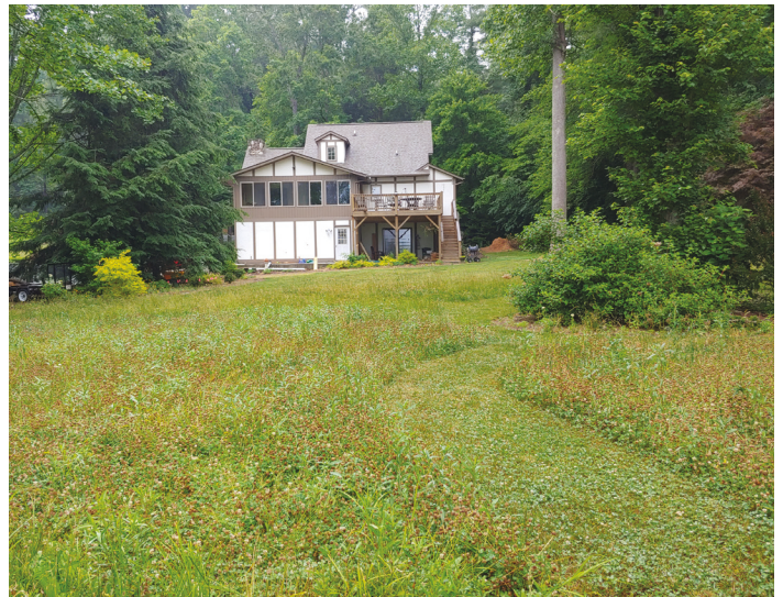
Figure 5, Mowpath. Choosing narrow mown paths to connect spaces allows for more lush vegetation in the surrounding untrafficked areas and less time devoted to mowing.