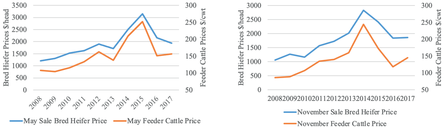
Figure 2. Bred heifer price ($/head) and feeder cattle price ($/cwt) for 500- to 600-pound heifers at the time of the May and November sale from 2008 to 2017.

Monthly Kentucky and Tennessee price data were collected for 500- to 600-pound heifers and averaged over this same time period (2008-2017; USDA Agricultural Marketing Service, 2017). November weanling heifer prices were analyzed for the spring-calving herd (November sale), and May weanling heifer prices were analyzed for the fall-calving herd (May sale) to determine if feeder heifer prices were correlated with bred heifer prices. The average price of 500- to 600-pound feeder heifers is shown in Figure 2 for the time period along with bred heifer sale price. The average heifer price in May was higher than November.