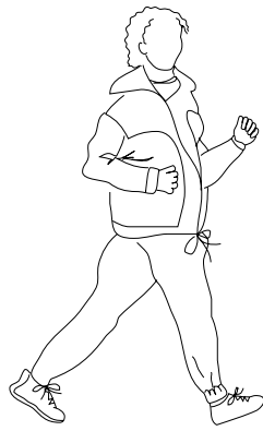
Try a daily walk.