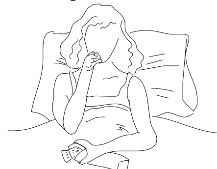
Eat your crackers in bed.