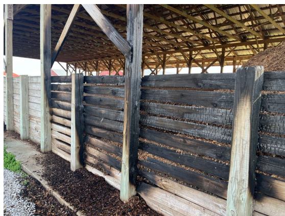
Figures 6 and 7. Litter stacked more than 7 feet high is a fire danger (Figure 6). Litter stacked more than 7 feet high can catch the shed on fire (Figure 7).