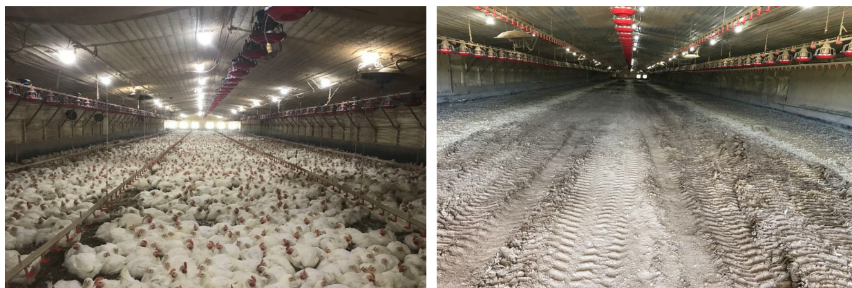
Figures 4 and 5. Wet litter may not appear to be an issue with market age birds in the house (Figure 4) obscuring the litter, but the problem becomes more evident when the flock is harvested. Note the tire tracks in the wet litter under the drinker lines (Figure 5).

together first starts in areas that are more prone to becoming wetter, like under the drinkers, along the sidewalls, and near migration fences. Adequate ventilation is critical to maintain the proper litter moisture. If you under-ventilate and allow caking to begin, the birds can no longer mix the manure into the litter and the top layer of litter starts to slick over, contributing to cake formation (Miles et al., 2008a; Miles et al., 2008b). Conversely, providing adequate ventilation helps maintain good litter conditions and allows birds to work the litter by scratching, which aerates and increases the litter porosity, thereby keeping the litter loose and friable which prevents cake formation, accelerating the release of water (Pepper and Dunlop, 2021). This allows air to enter the litter, which promotes increased microbial activity that generates heat that further contributes to water release from the litter and encourages breakdown of organic material deposited with the feces (Lister, 2009).