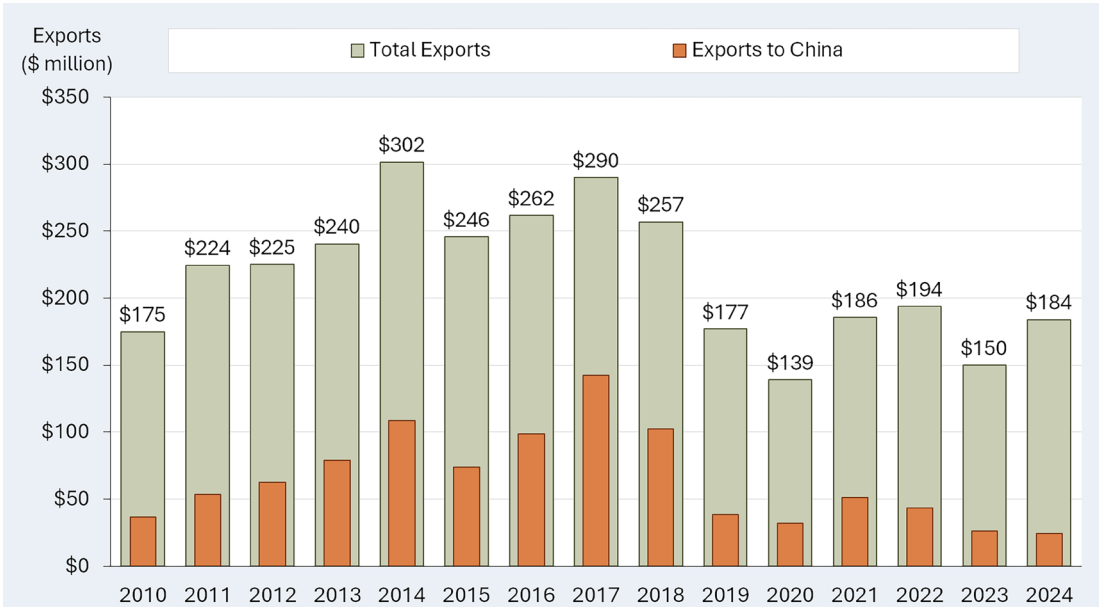
Figure 1: Tennessee Forest Product Exports: 2010-2024 Source: USDA, Foreign Agricultural Service (2025).