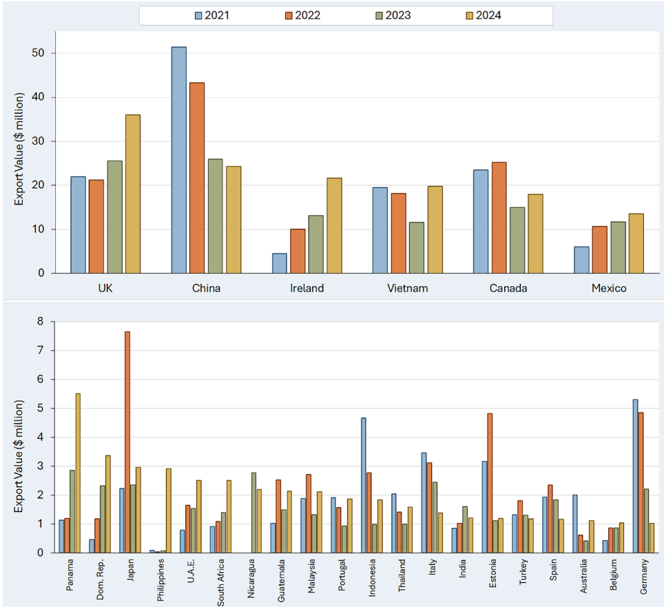
Figure 2: Tennessee Forest Product Exports by Top Destination Countries: 2021-2024 Note: Countries are ordered based on 2024 export sales. Source: USDA, Foreign Agricultural Service (2024).